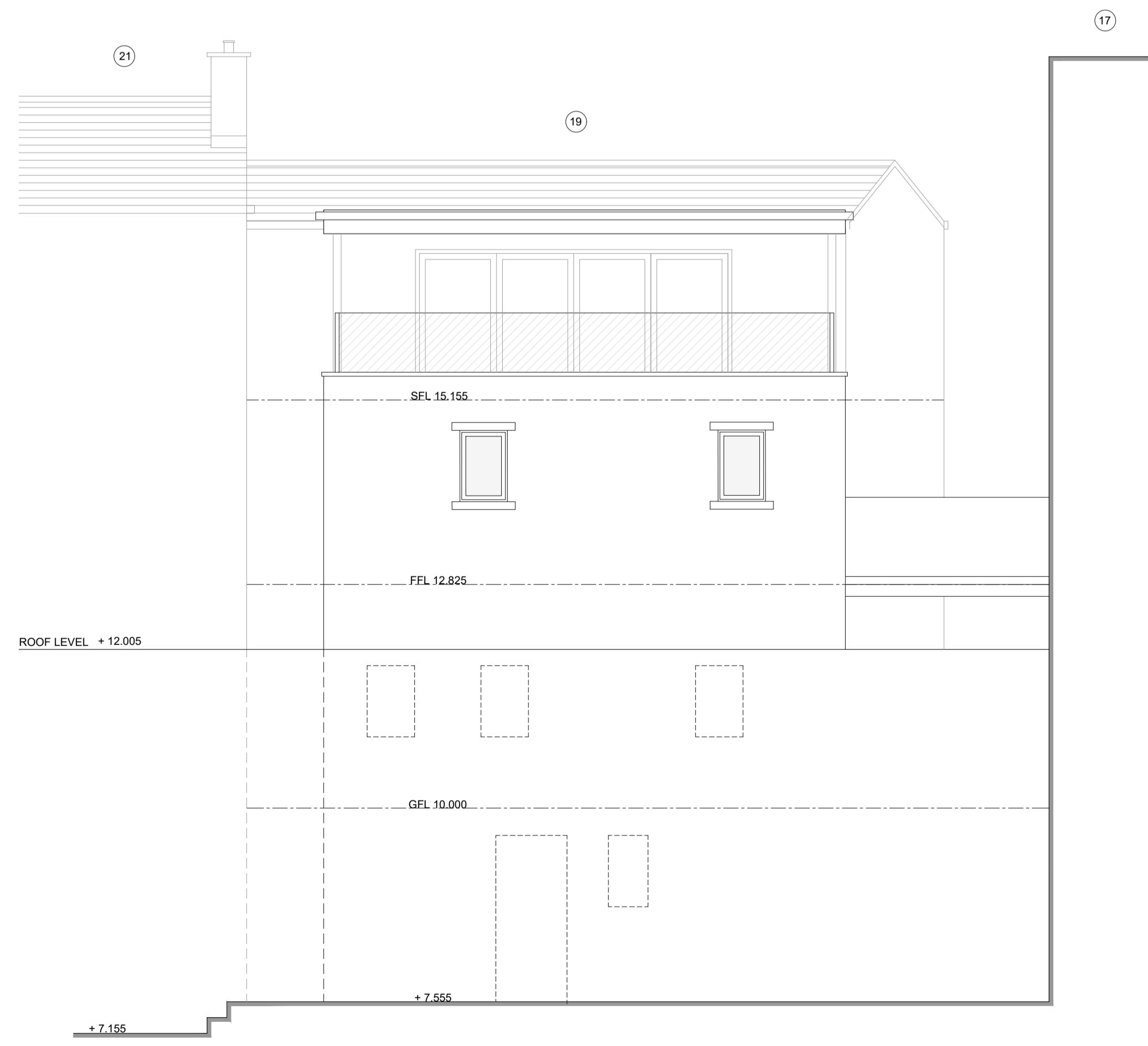
SOUTH EAST ELEVATION (As Proposed)