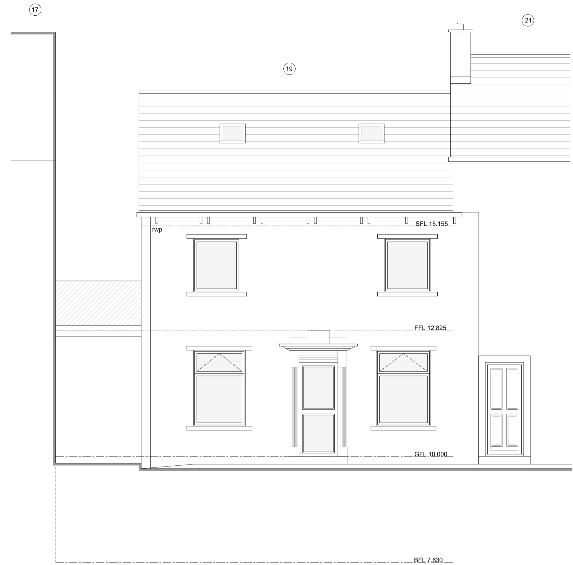
NORTH WEST ELEVATION (As Proposed)