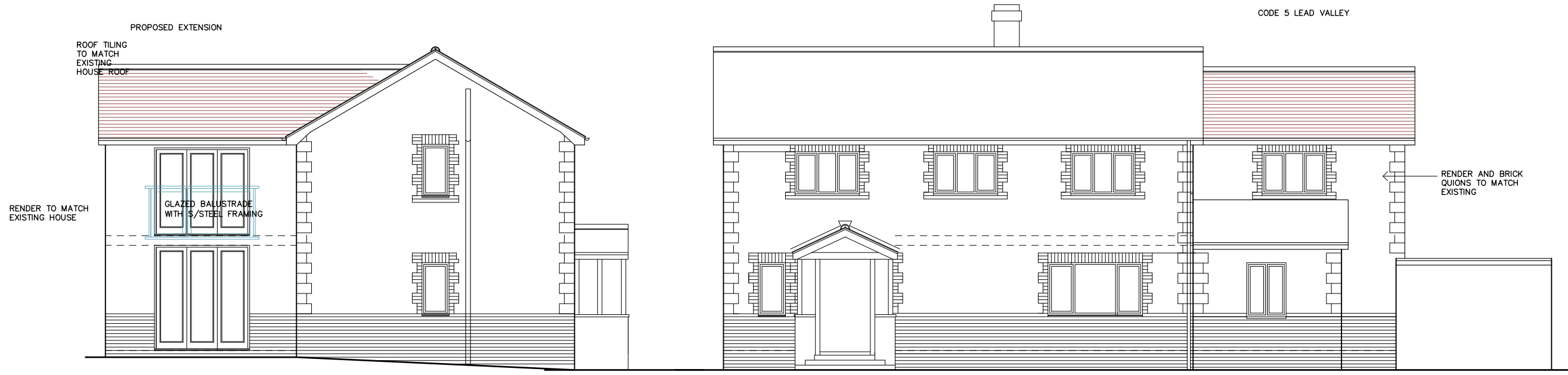
SIDE ELEVATION FACING DRIVEWAY