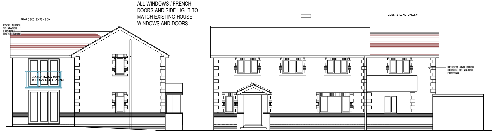
FRENCH DOORS AND SIDE LIGHTS

Note - extension doors and windows window material revised from timber to UPVC