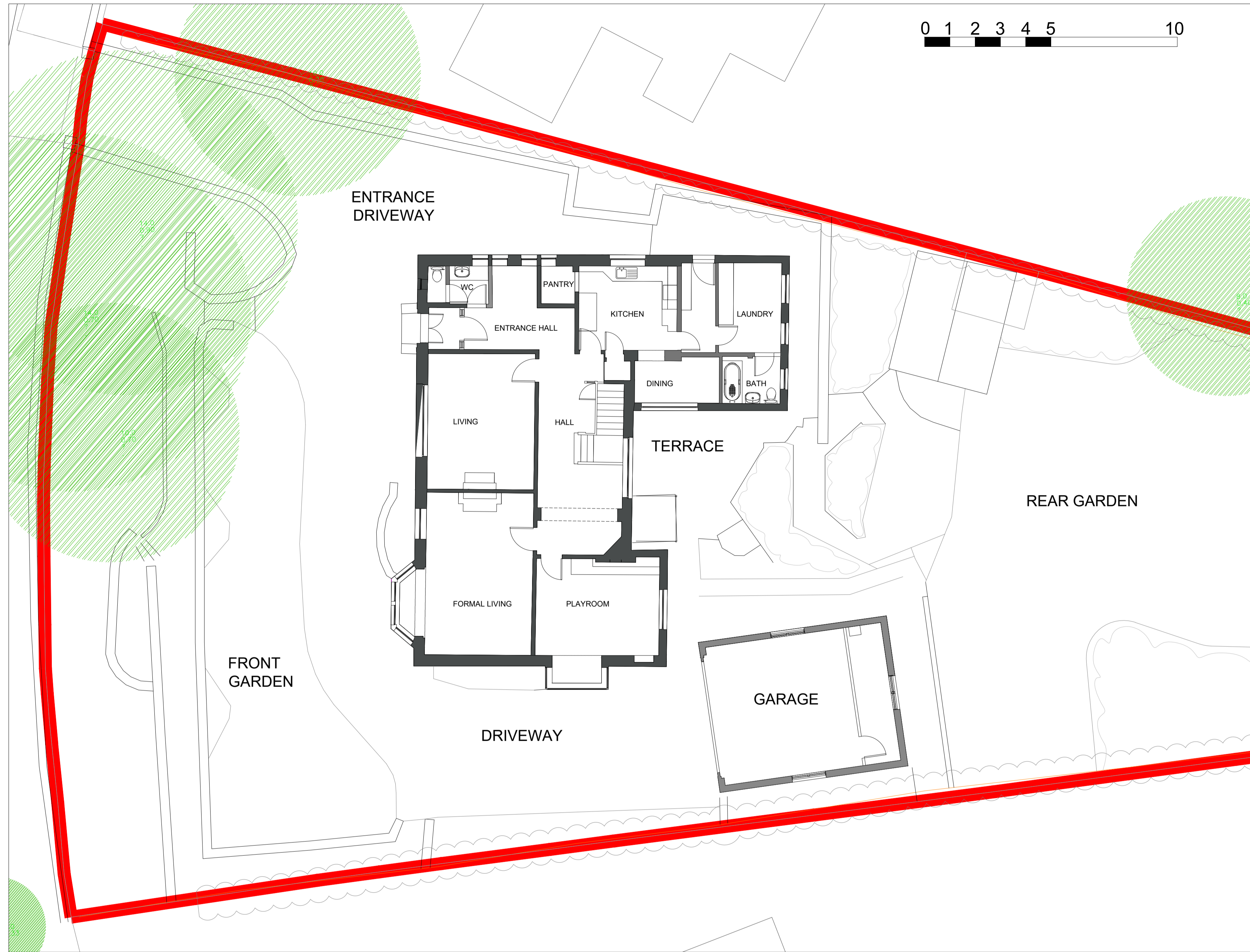
EXISTING GROUND FLOOR PLAN 1:100