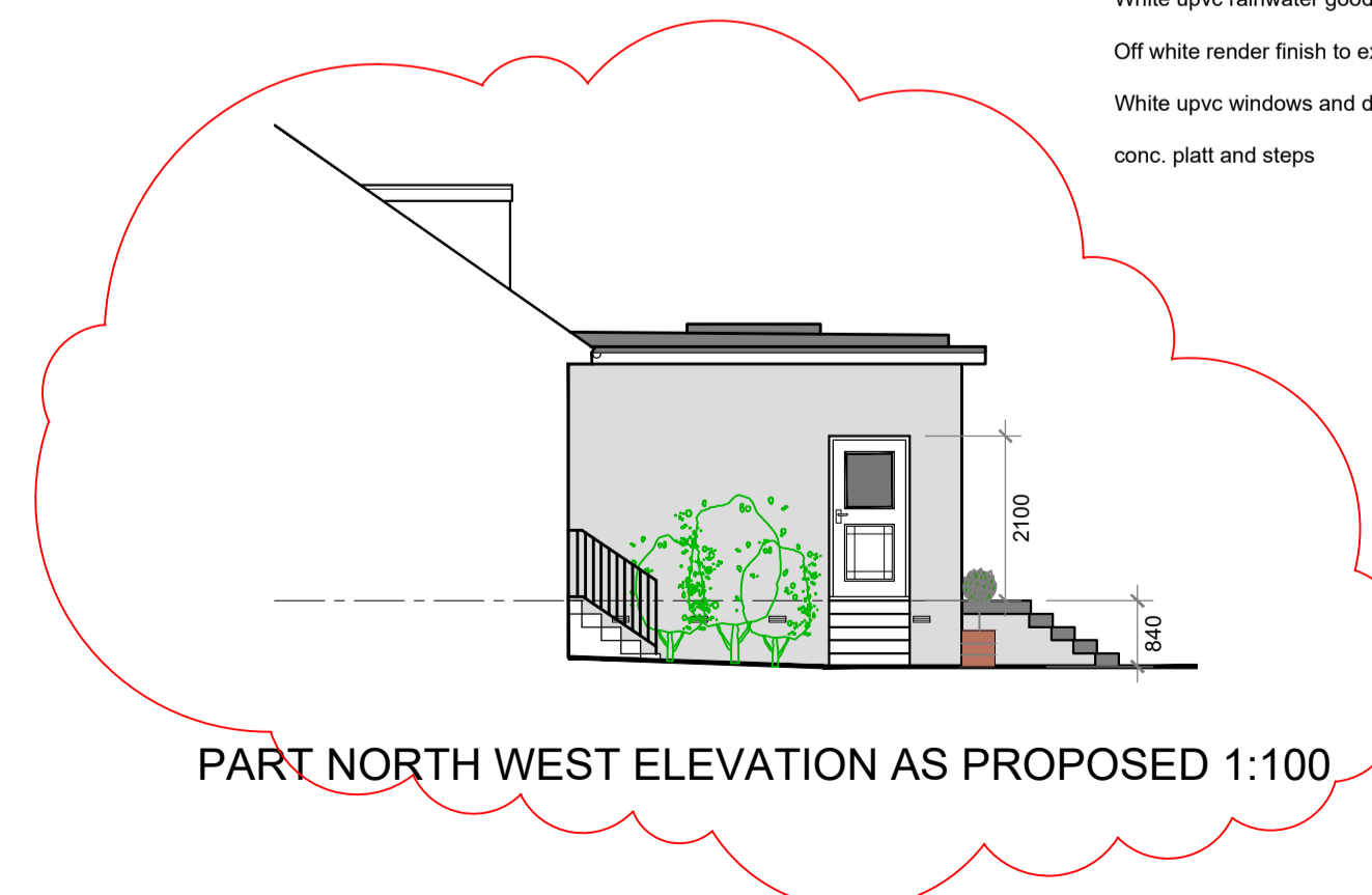
PART NORTH WEST ELEVATION AS PROPOSED 1:100