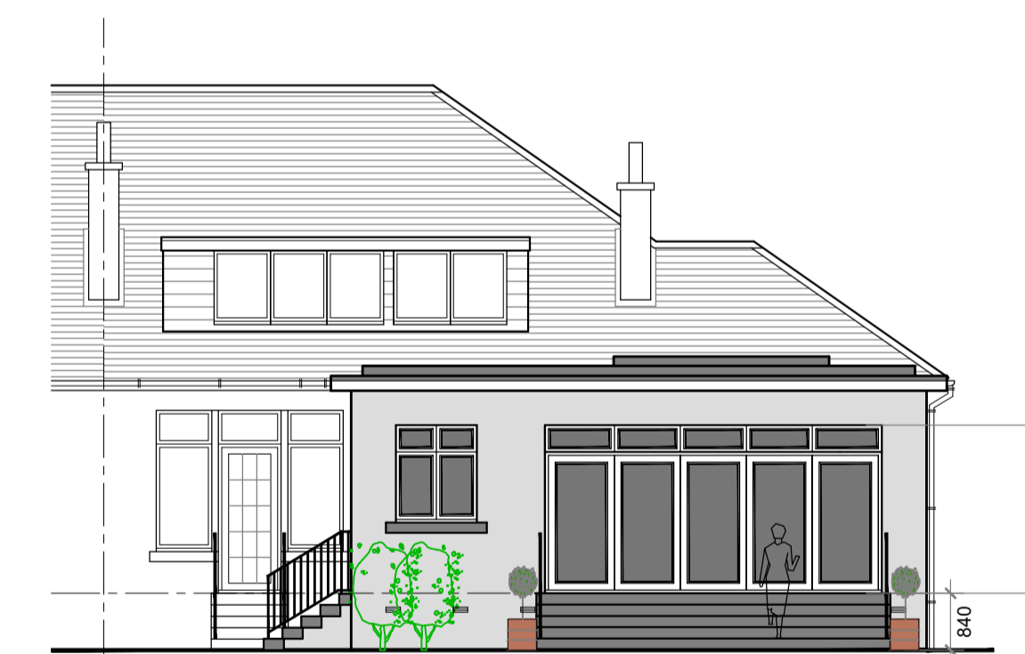
SOUTH WEST ELEVATION AS PROPOSED 1:100