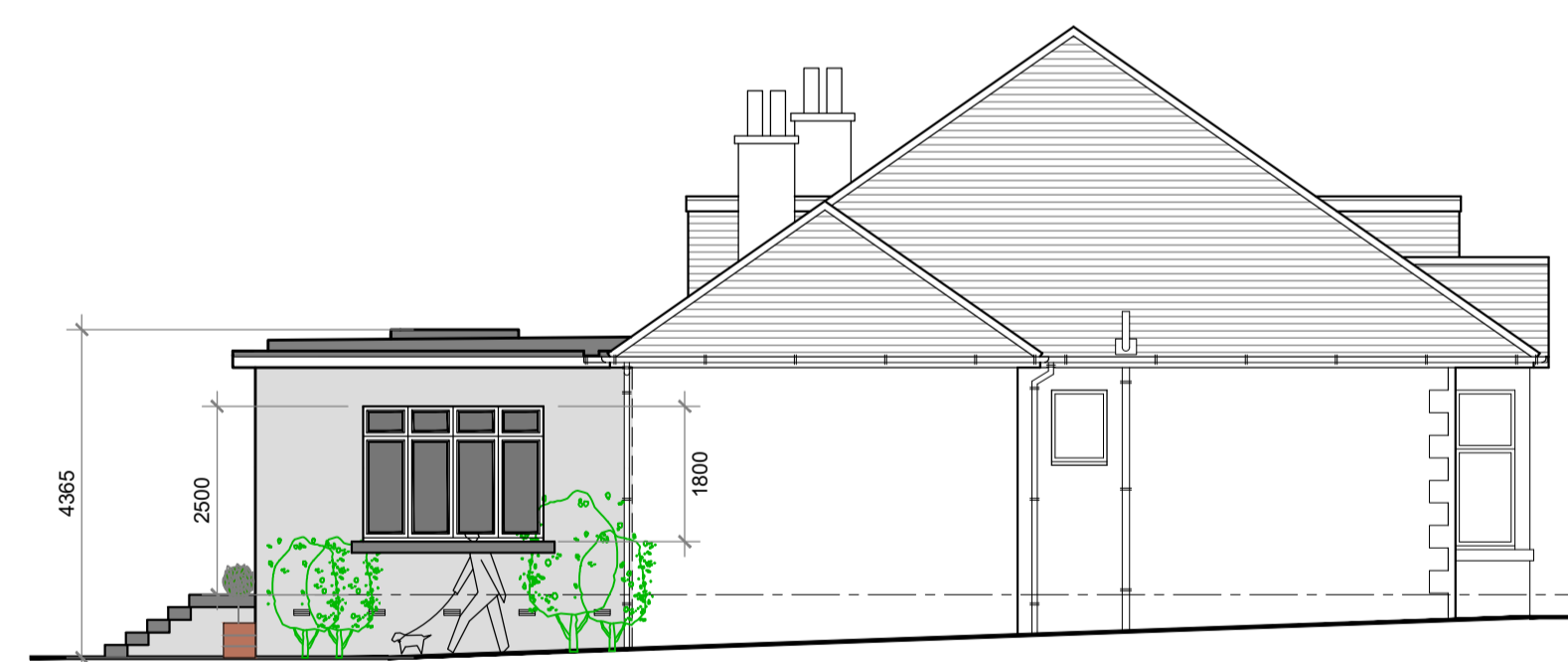
SOUTH EAST ELEVATION AS PROPOSED 1:100