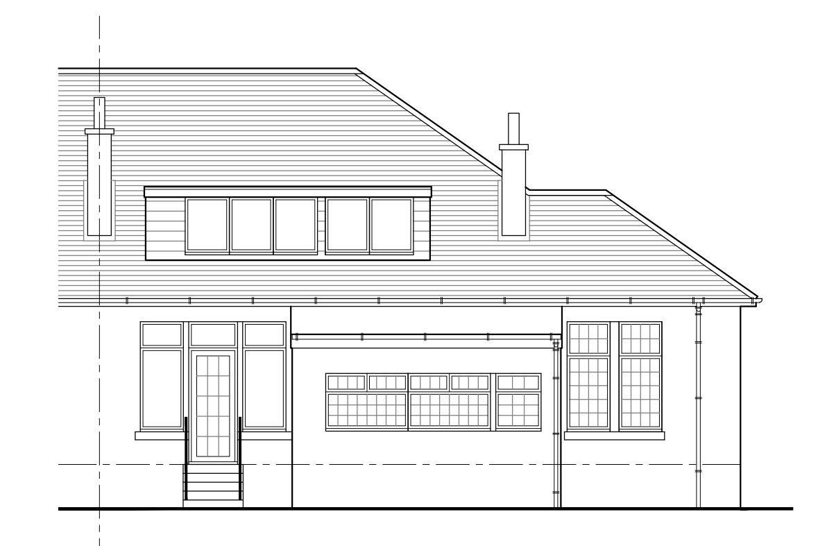
SOUTH WEST ELEVATION AS EXISTING 1:100