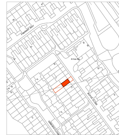
OS MAP Scale 1:2500 @A3