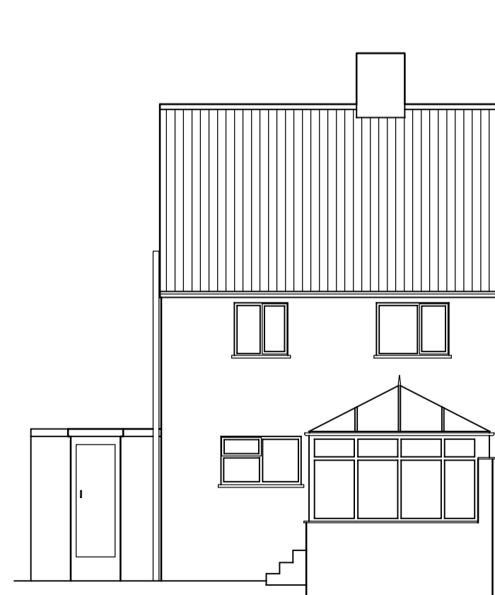
Existing Rear Elevation 1:100