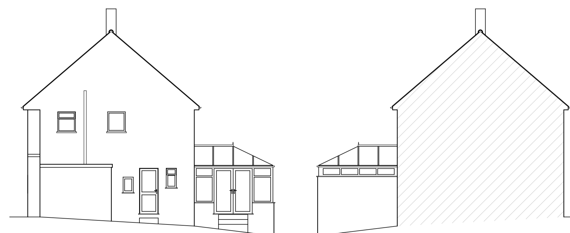
Existing Side Elevations 1:100

When printing off pdf drawings, it is the responsibility of the user to verify that the resulting prints are to scale on the appropriate sized sheet. Also the scale bar on the plan measure correctly.