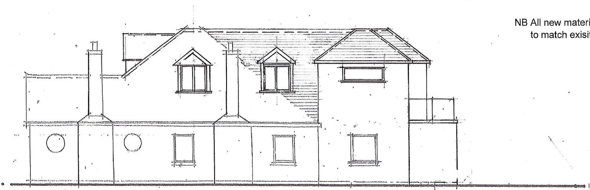
Proposed Side Elevation (West)