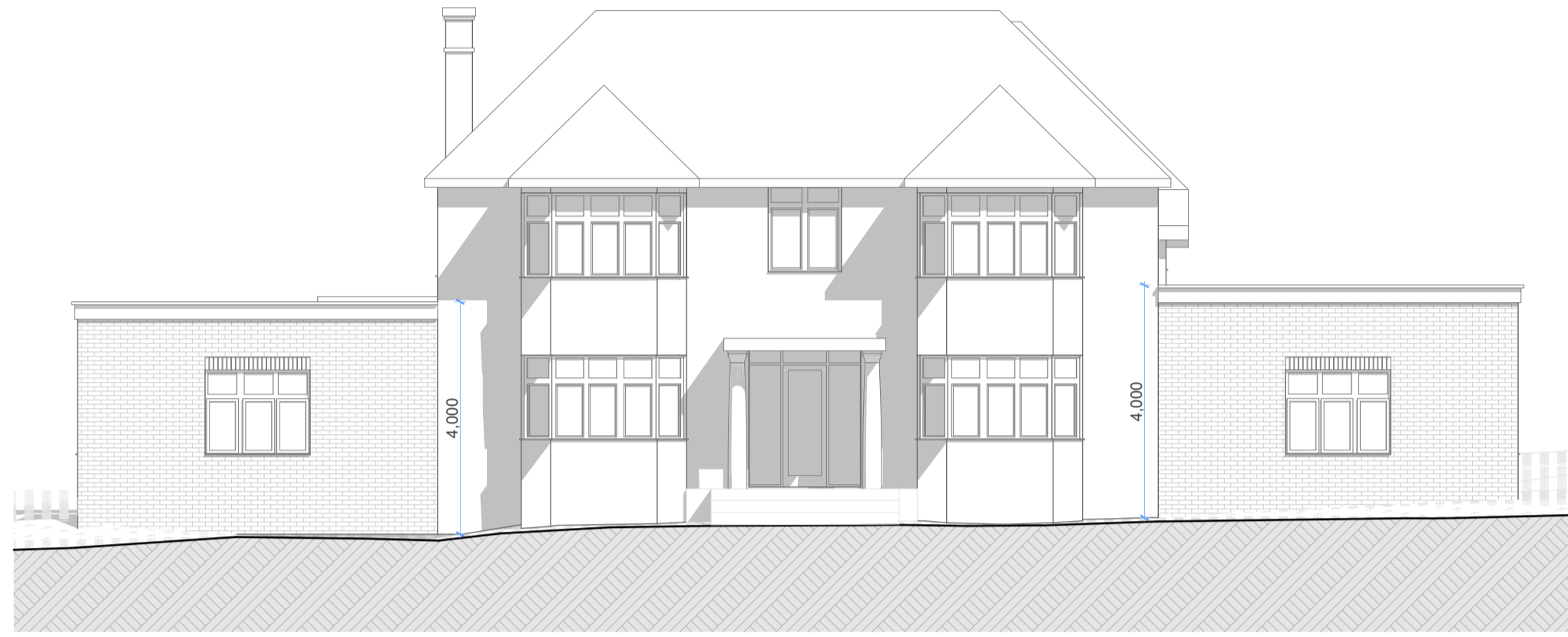
E-01.1 Front Elevation 1:100