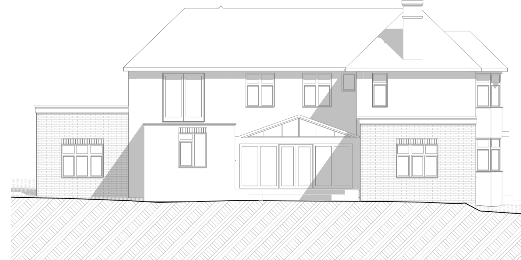
E-01.4 Side Elevation 2 1:100