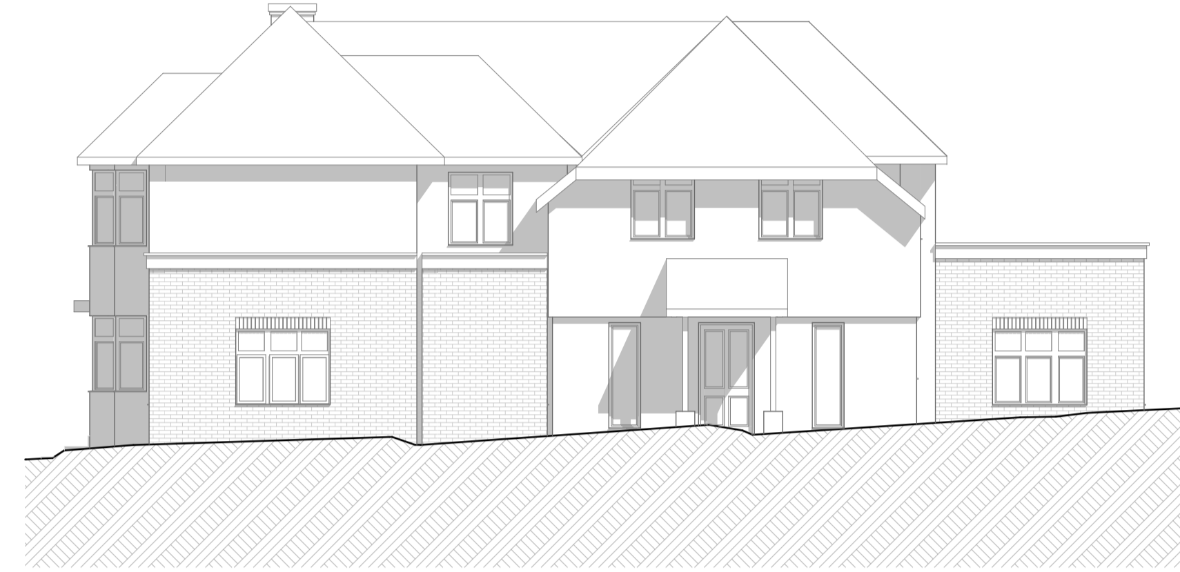
E-01.3 Side Elevation 1 1:100