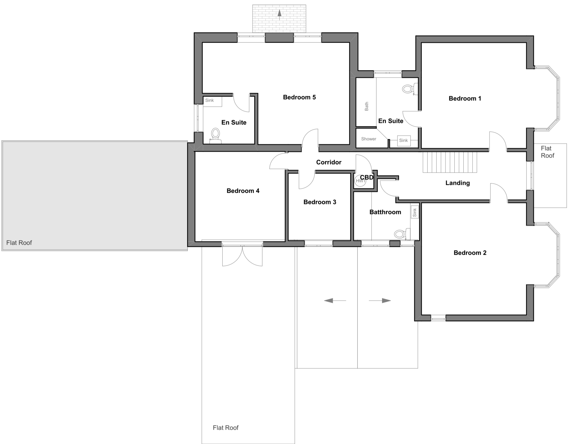
1. First Floor 1:100