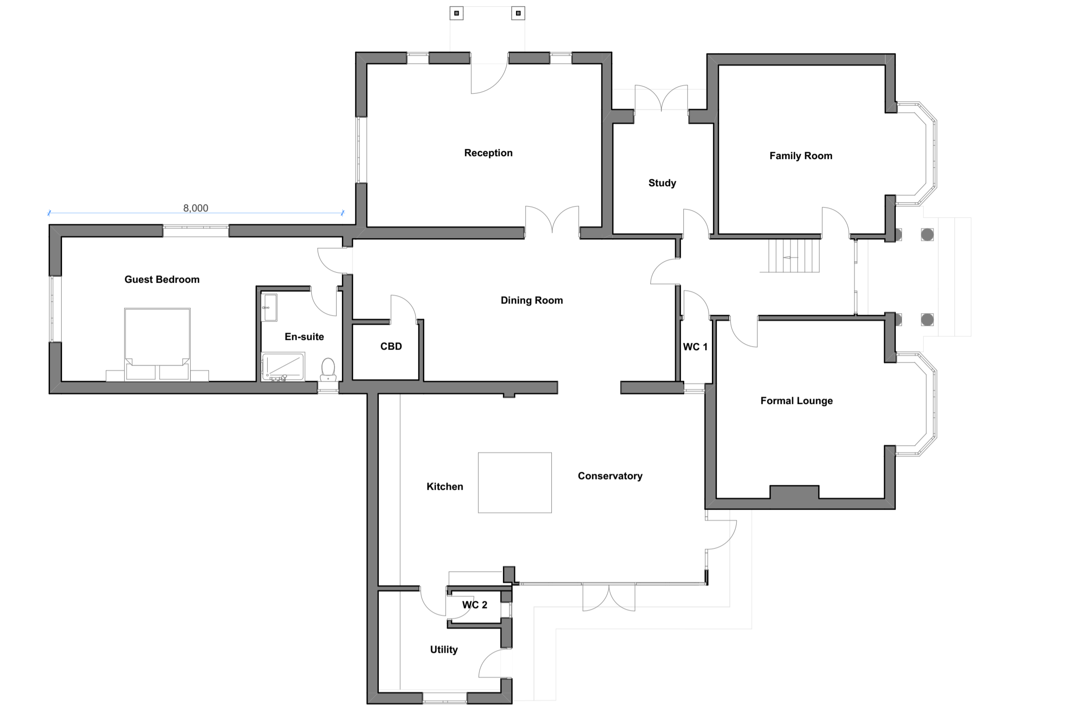
0. Ground Floor 1:100