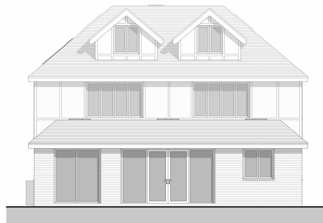
REAR (NORTH-EAST FACING) ELEVATION Scale 1 : 100