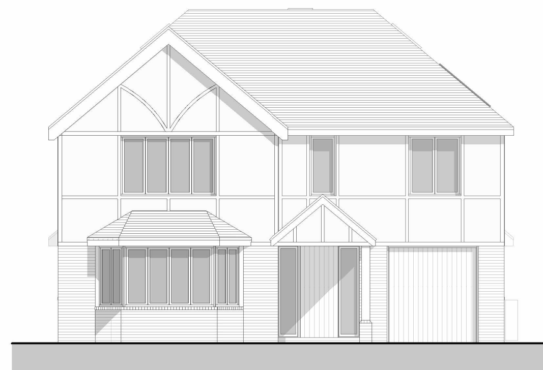
FRONT (SOUTH-WEST FACING) ELEVATION Scale 1 : 100

Notes: Do Not Scale. Use only figured dimensions. All dimensions to be checked on site prior to construction. Any discrepancies to be notified to the architects. All Copyright Reserved to Offset Architects.