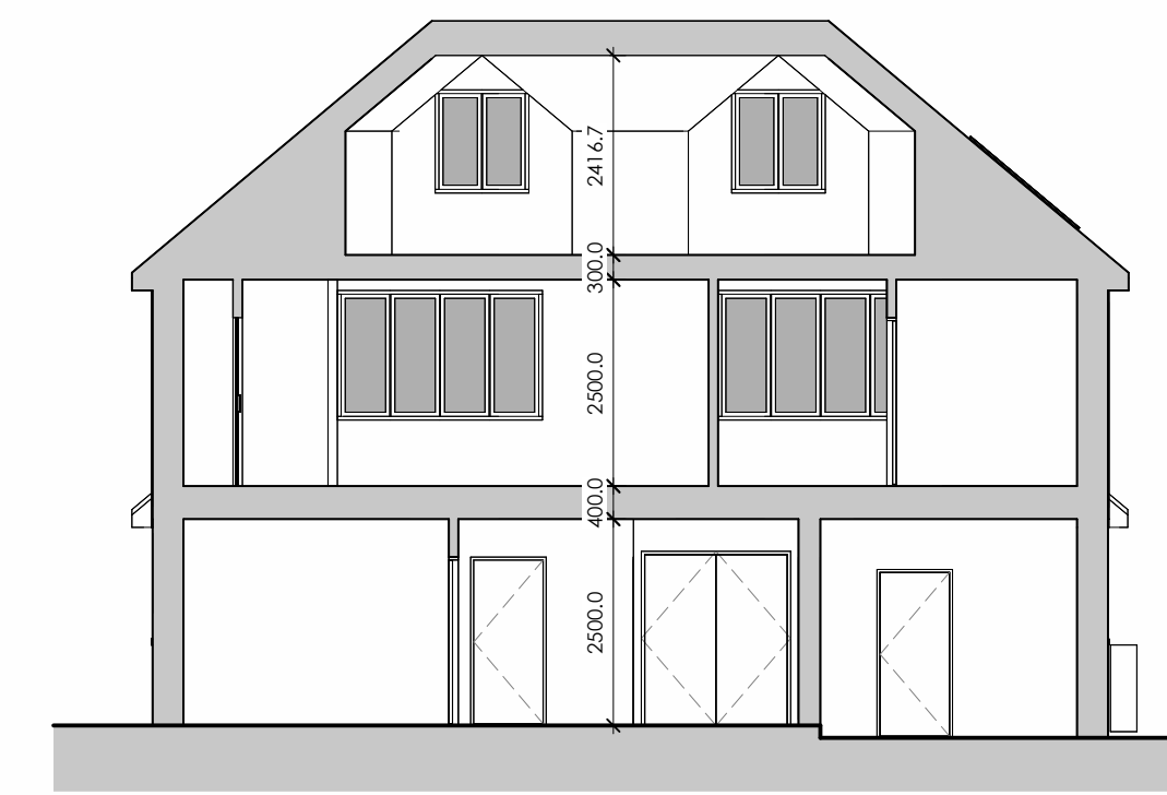
Section 1 Scale 1 : 100