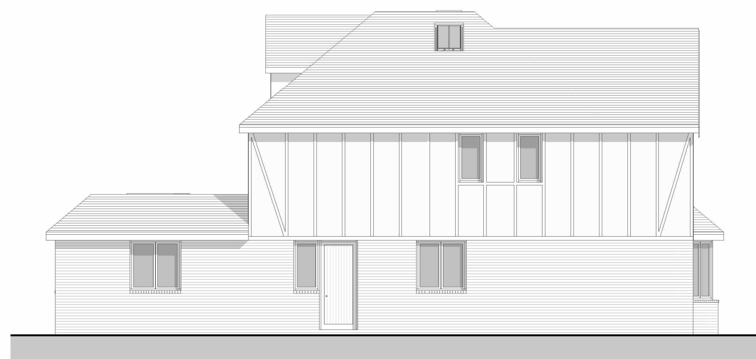
SIDE (NORTH-WEST FACING) ELEVATION Scale 1 : 100