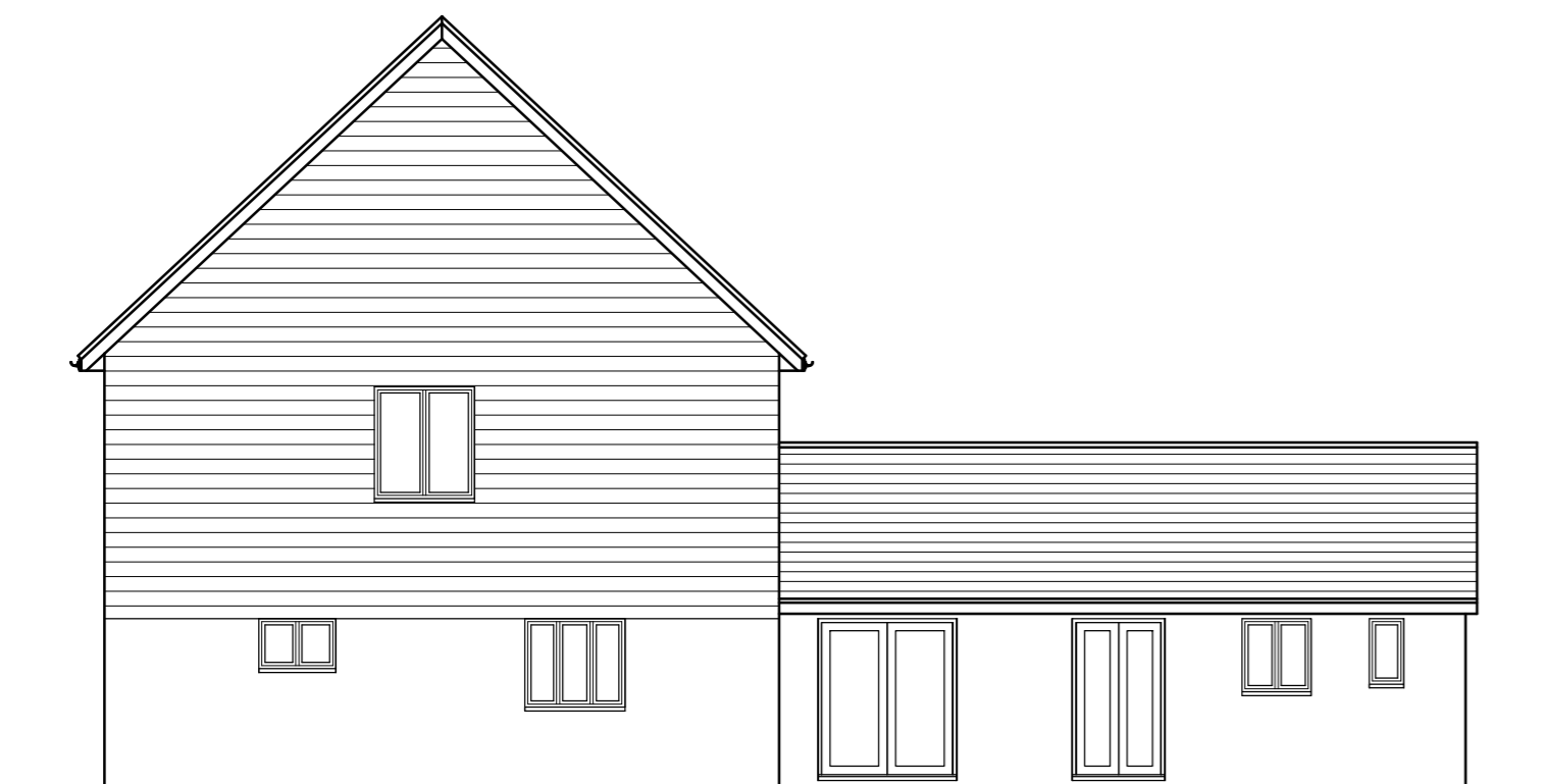
DATUM = 65.0 SOUTH-WEST ELEVATION APPROVED