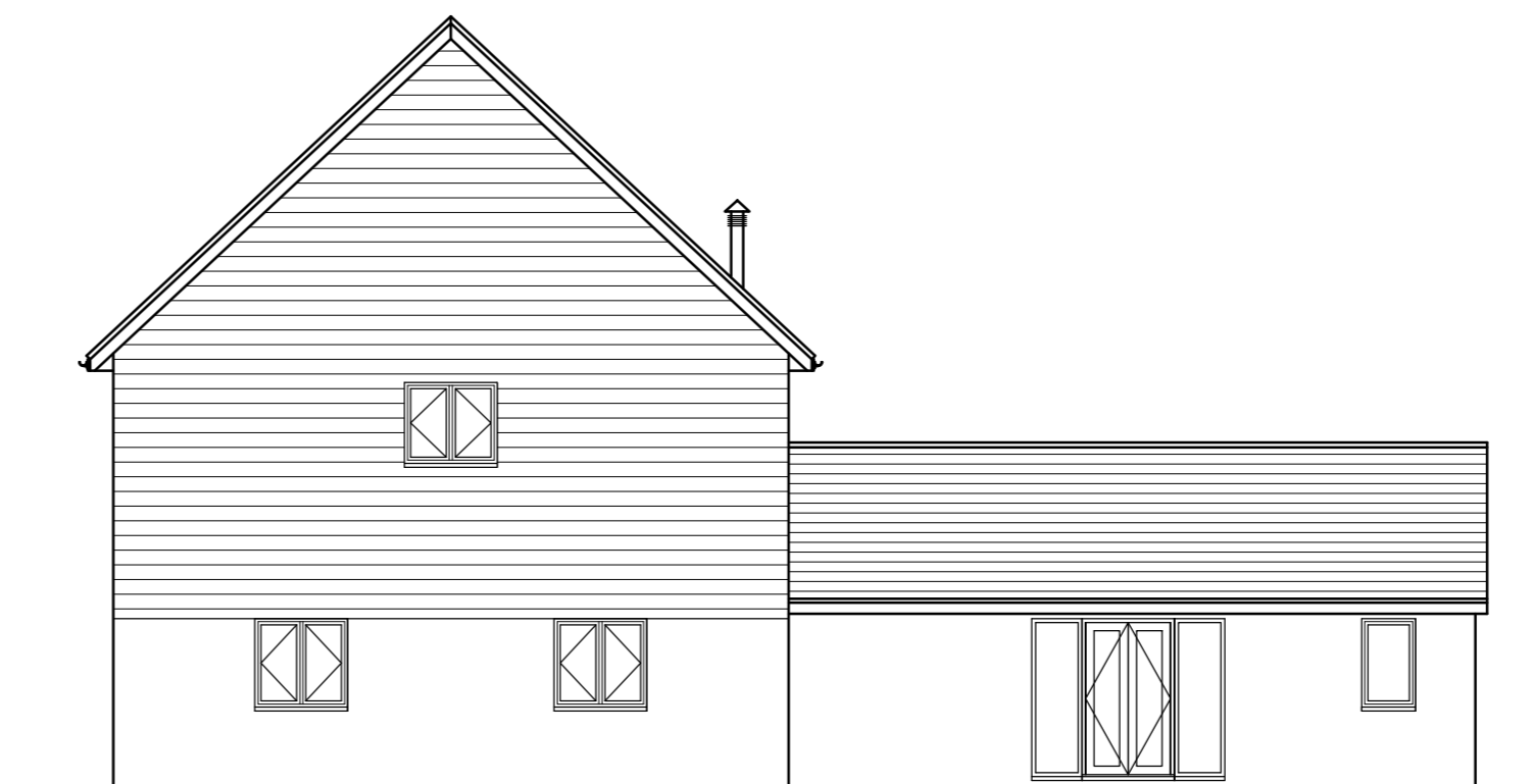
DATUM = 65.0 SOUTH-WEST ELEVATION PROPOSED