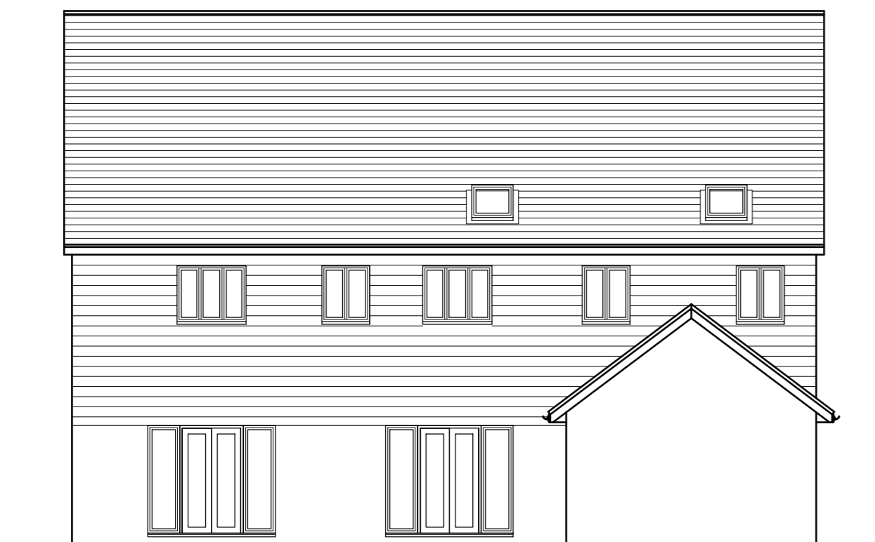
DATUM = 65.0 SOUTH-EAST ELEVATION APPROVED