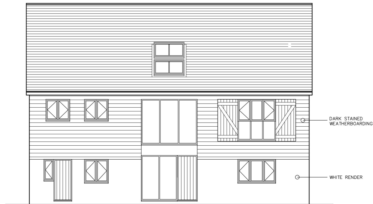
DATUM = 65.0 NORTH-WEST ELEVATION PROPOSED