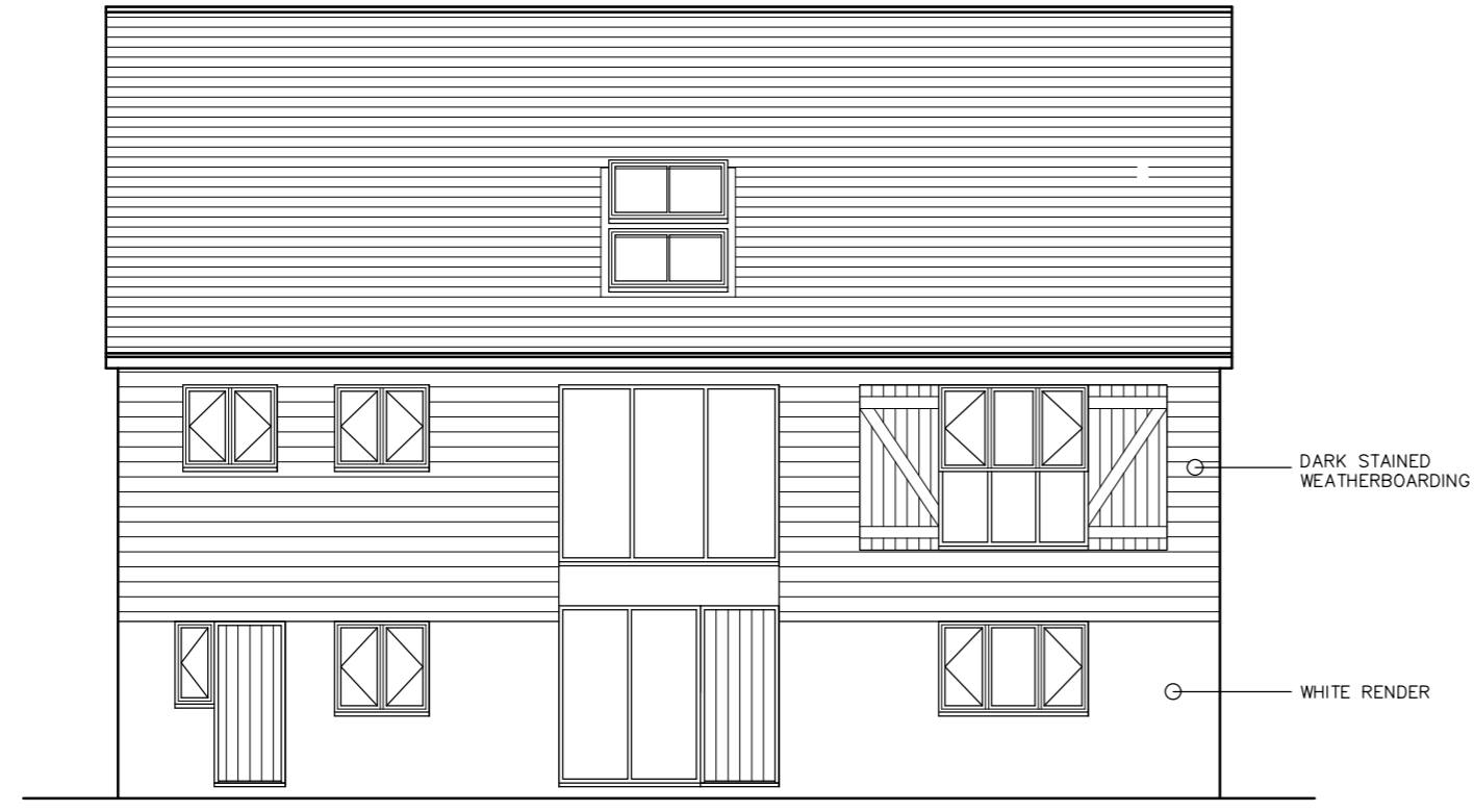
DATUM = 65.0 NORTH-WEST ELEVATION