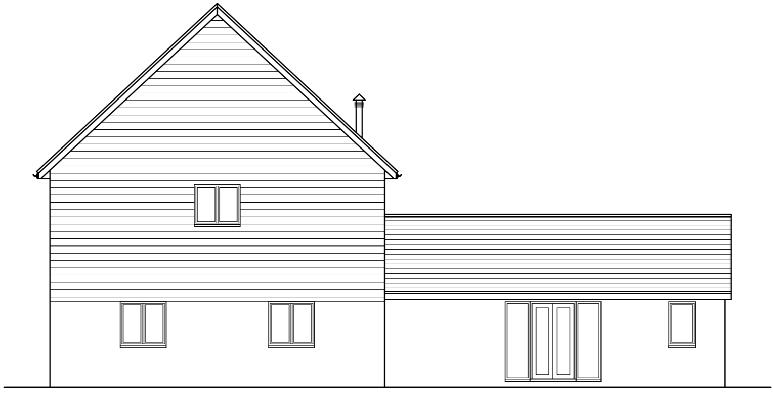
DATUM = 65.0 SOUTH-WEST ELEVATION