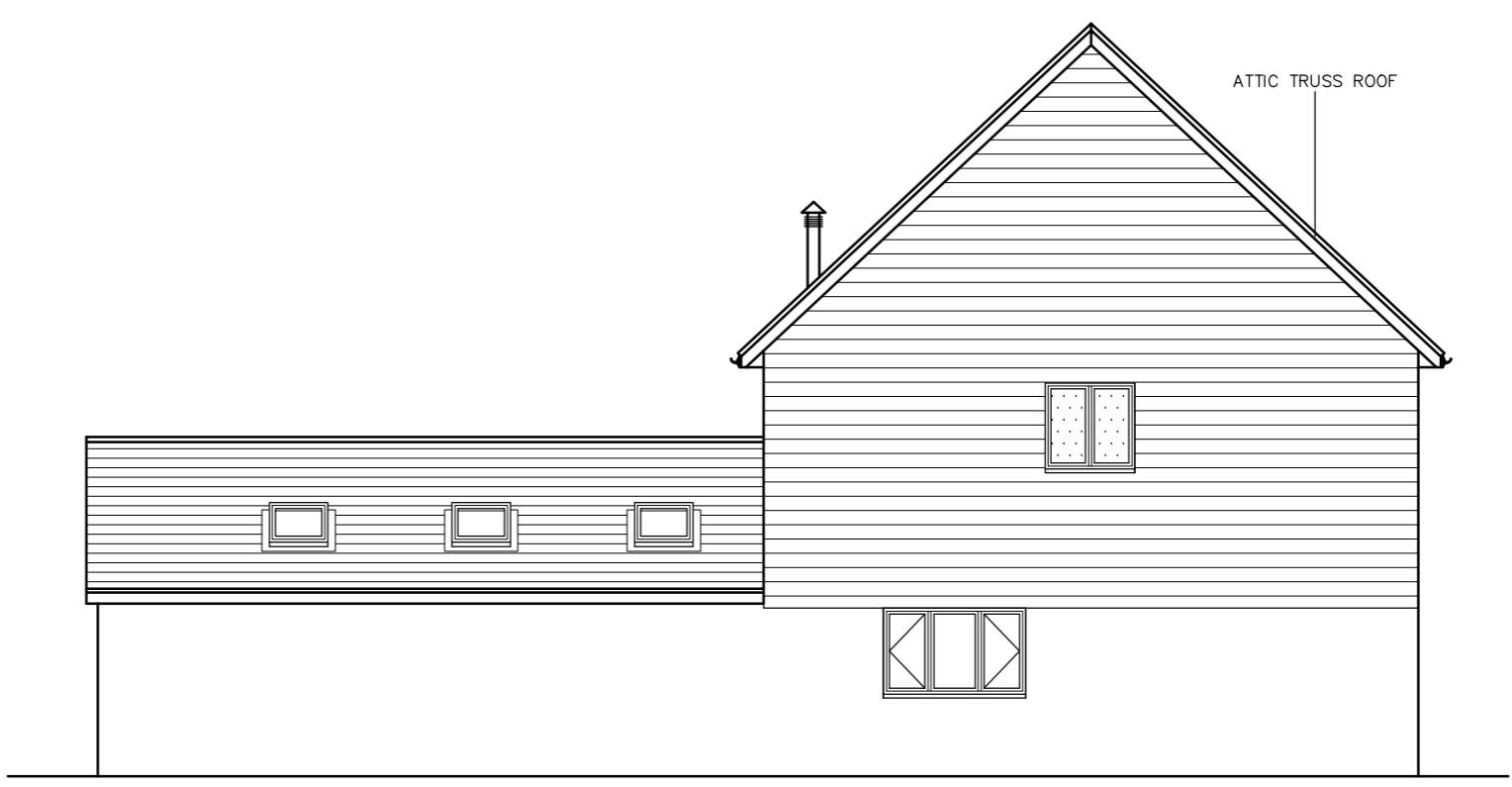
DATUM = 65.0 NORTH-EAST ELEVATION