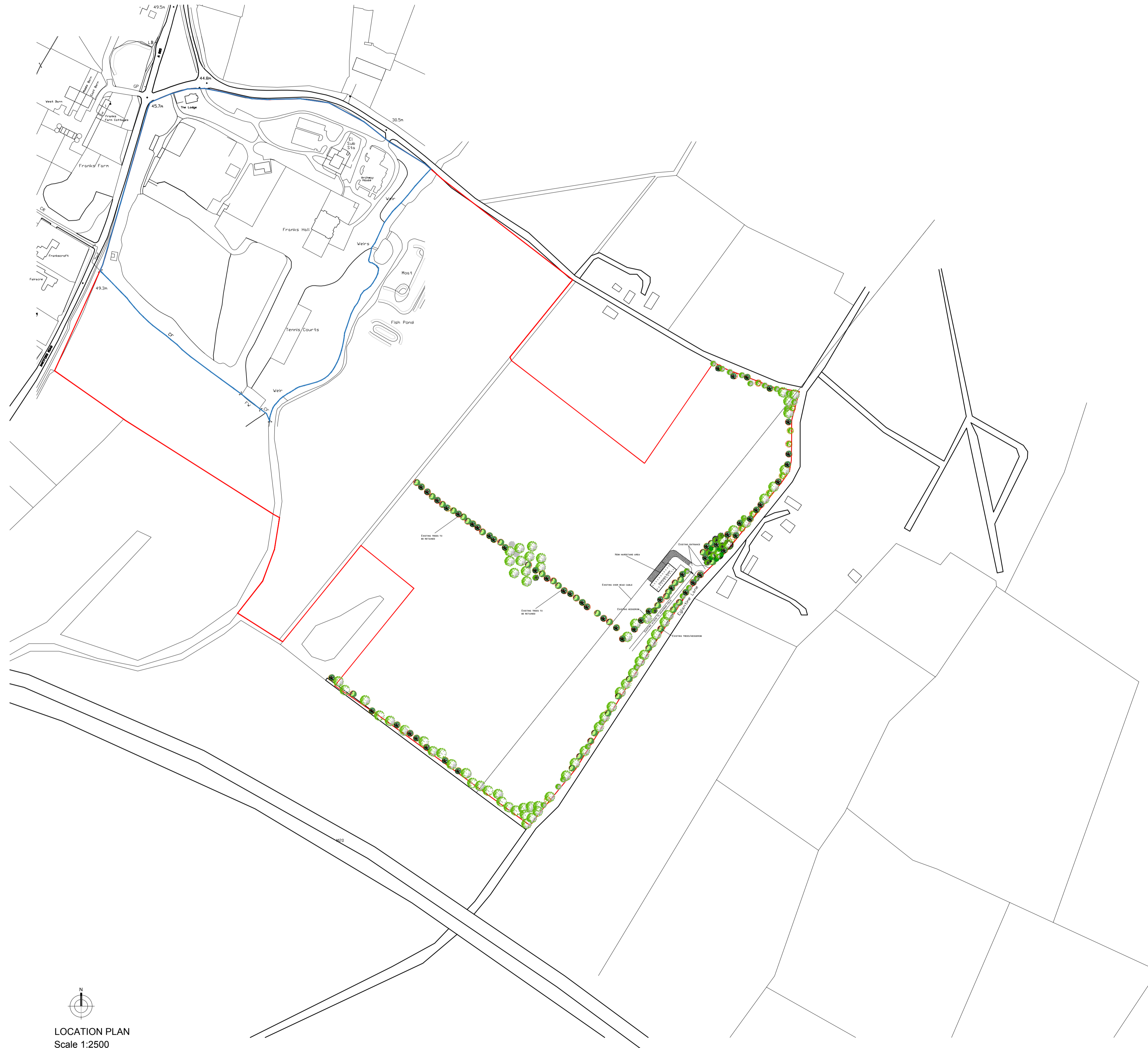
LOCATION PLAN Scale 1:2500

Notes: Do Not Scale. Use only figured dimensions. All dimensions to be checked on site prior to construction. Any discrepancies to be notified to the architect.