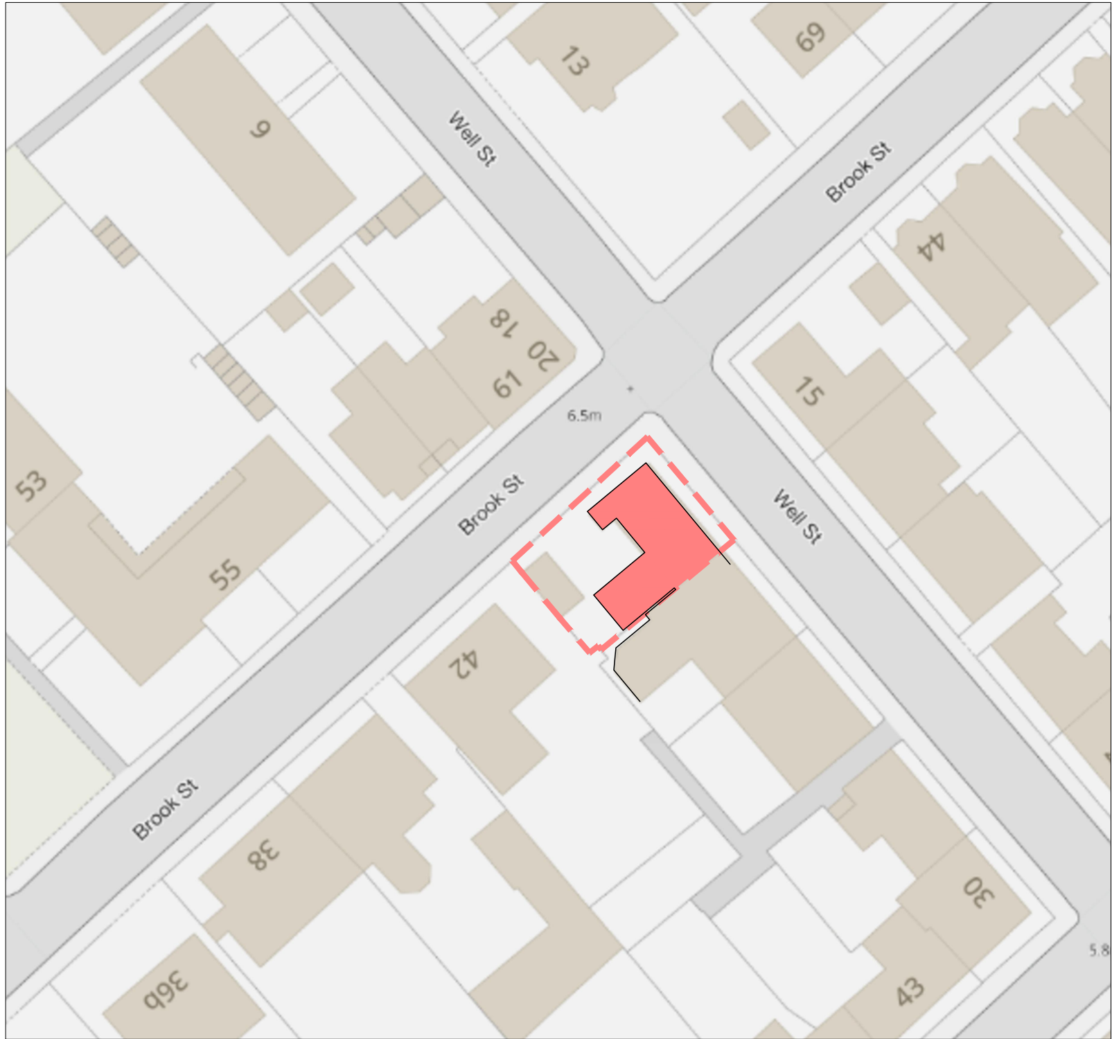
PROPOSED SITE PLAN Scale 1:500