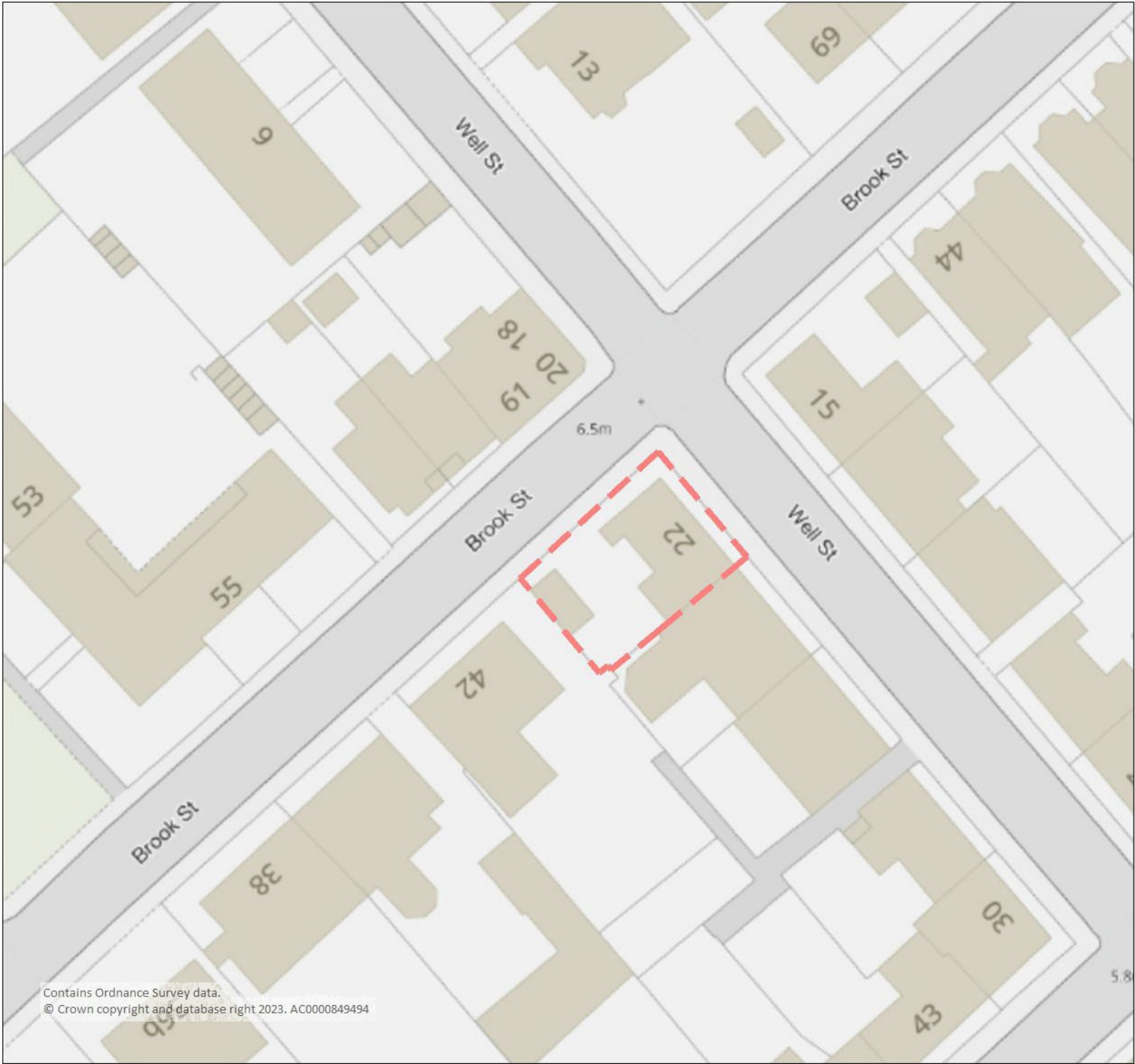
EXISTING SITE PLAN Scale 1:500