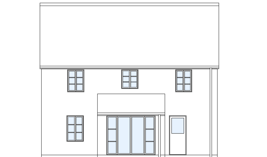
1 Existing Front Elevation