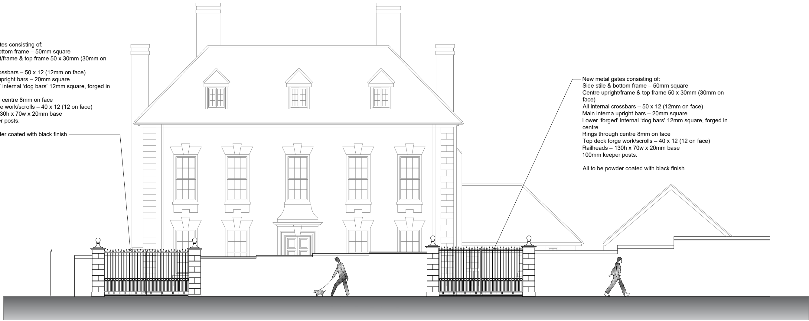
Proposed Front Elevation 1:100

All to be powder coated with black finish