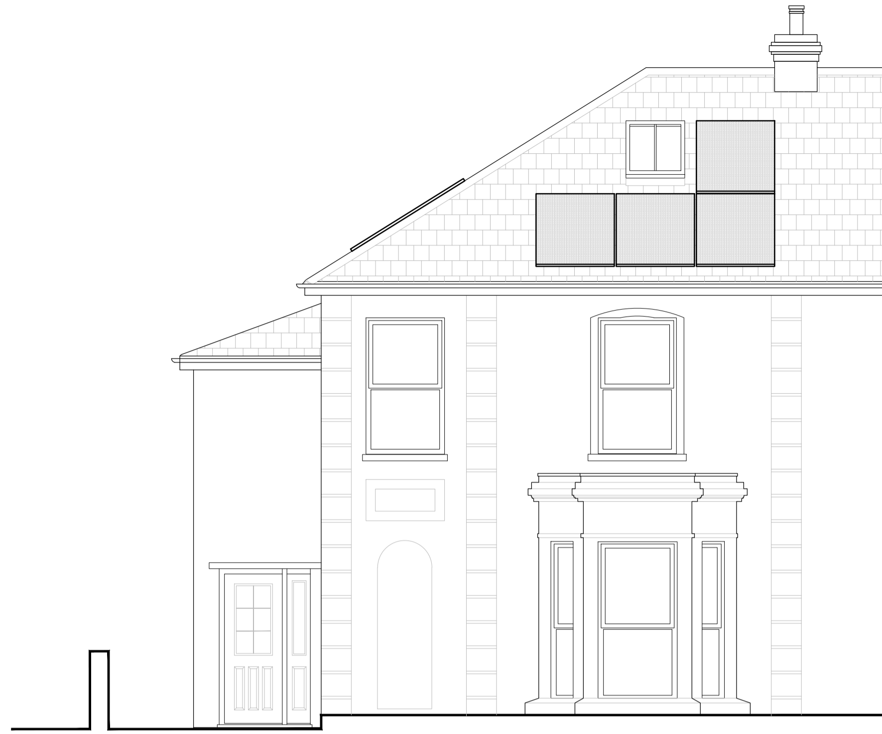
FRONT ELEVATION (SOUTH EAST)

ALL DIMENSIONS SUBJECT TO CONFIRMATION BY SITE MEASUREMENTS.