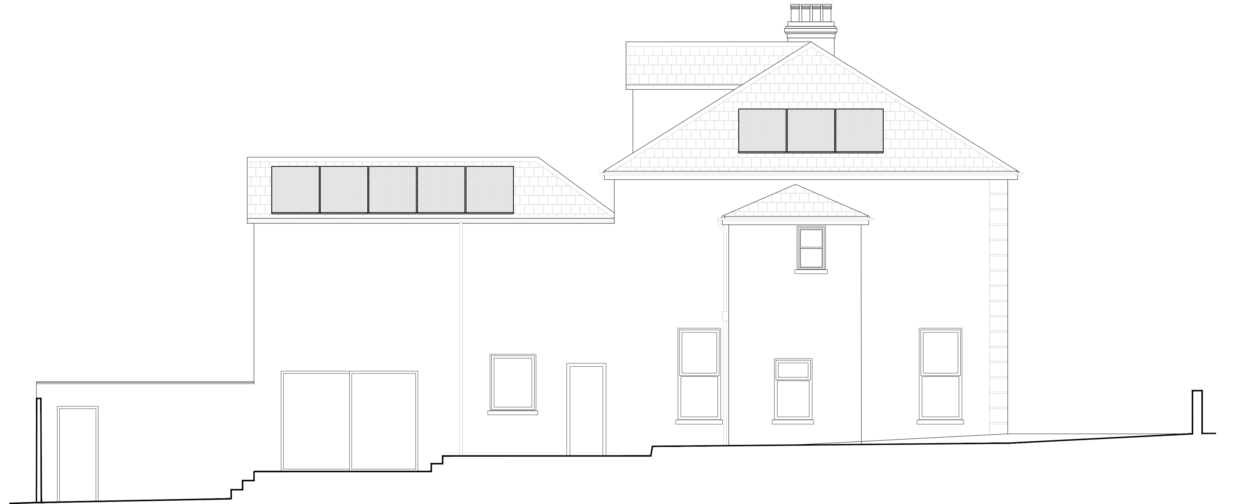
SIDE ELEVATION (SOUTH WEST)

PROPOSED LOFT EXTENSION 10 MARLBOROUGH ROAD FALMOUTH