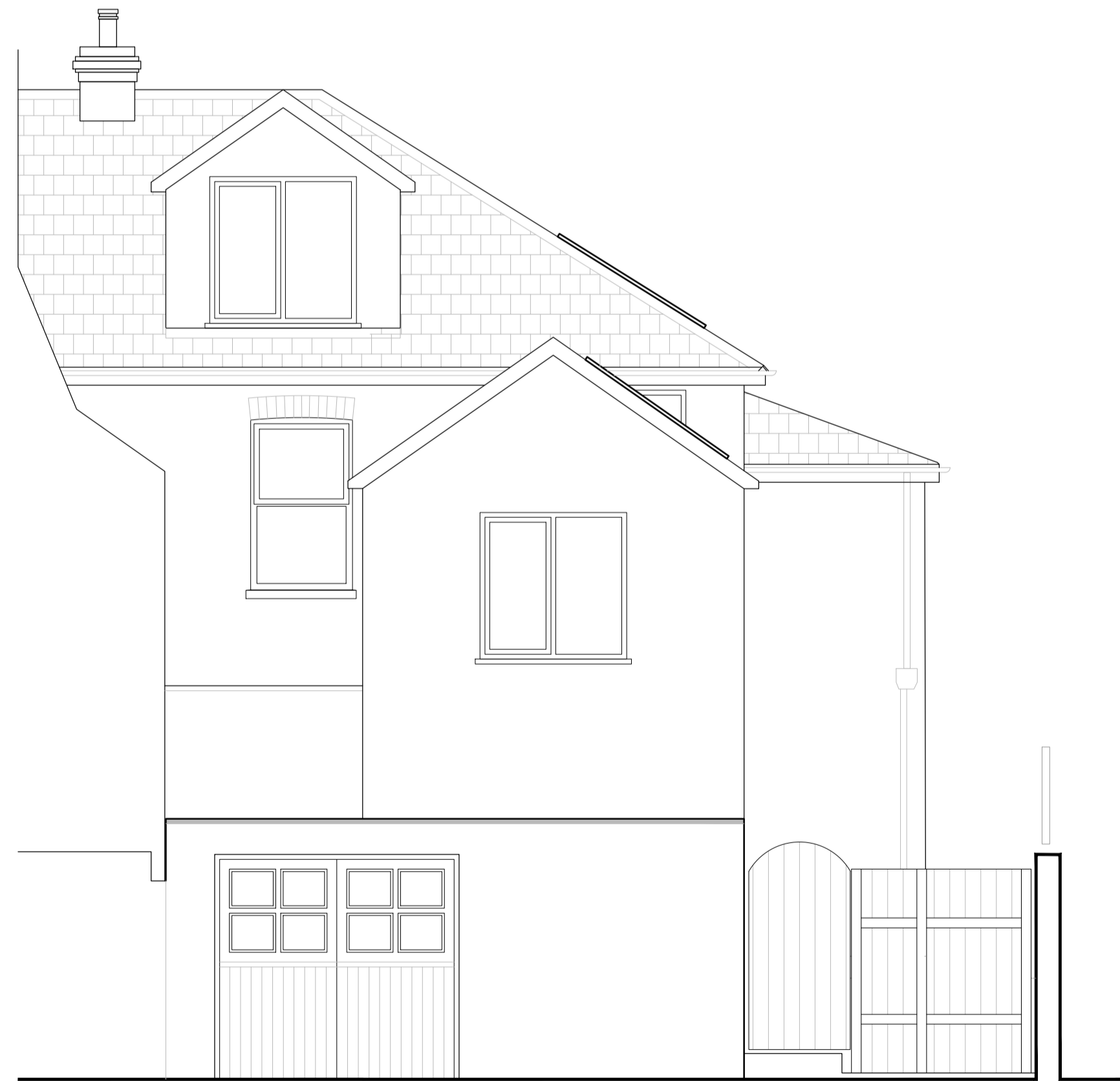
REAR STREET ELEVATION (NORTH WEST)