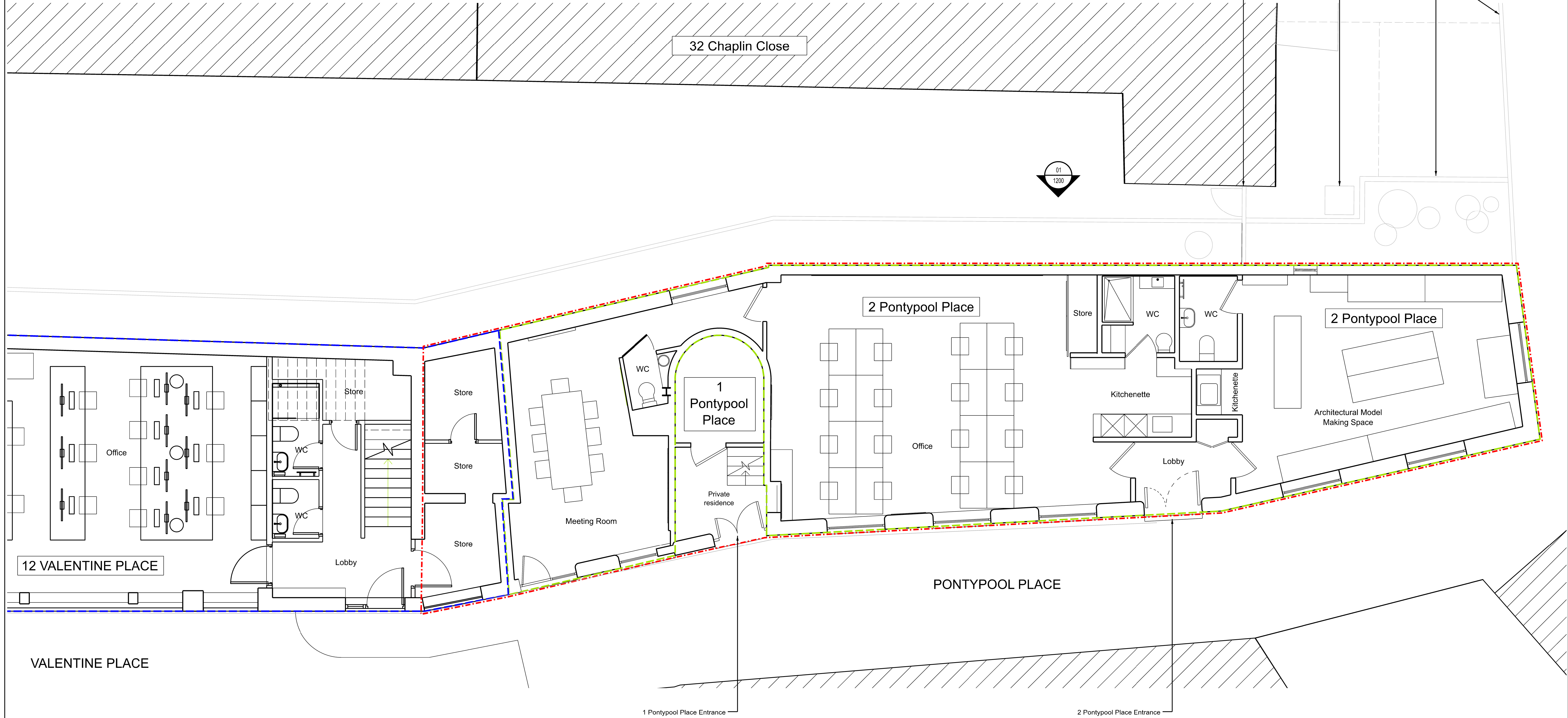
01 Existing Ground Floor Plan @ 1:50 (1:100 @ A3)