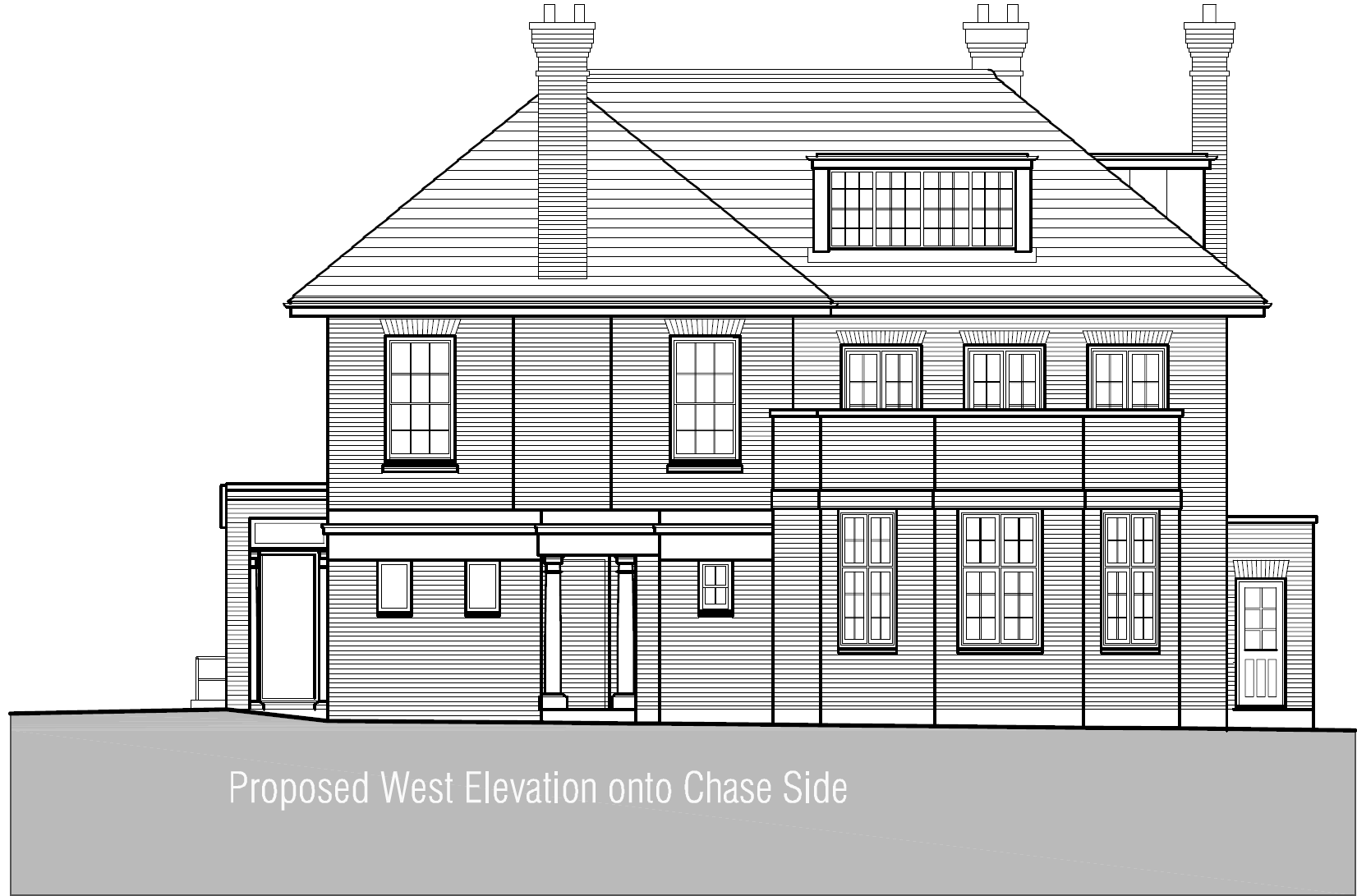
Proposed West Elevation onto Chase Side

Do not scale from this drawing. All dimensions and levels are to be checked on site. All areas are approximate and are for information only. This drawing is to be read in conjunction with all other relevant documents and all works are to comply with the current Building regulations, British Standards and Codes of Practice etc. All details of the existing structure are to be verified by others on site prior to any works commencing. The copyright of this drawing and all works executed from this drawing remain the property of View Associates Ltd. Any 3rd party survey information contained on this drawing is not the responsibility of View Associates Ltd.