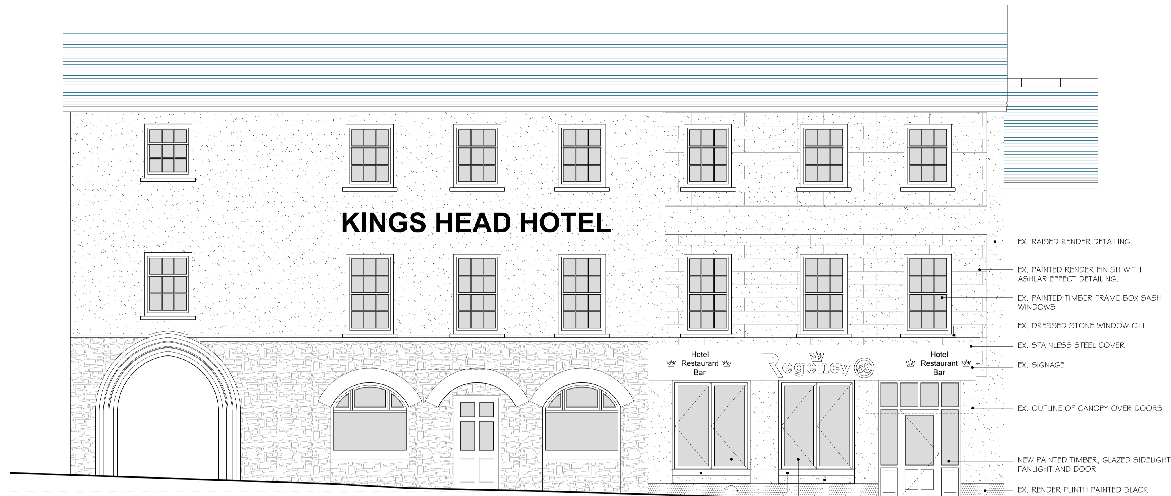
SOUTH WEST ELEVATION ONTO CROSS STREET SCALE 1:50