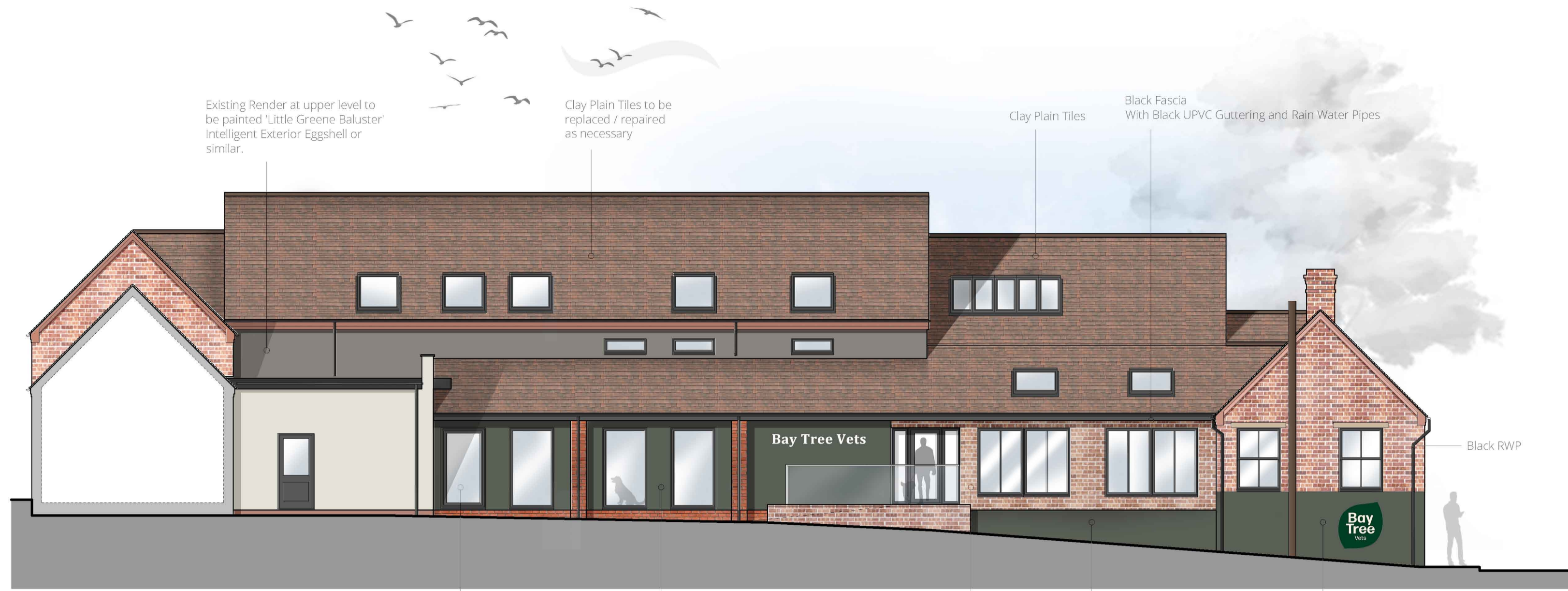
FRONT ELEVATION AS PROPOSED Scale 1:100

Existing Render at upper level to be painted 'Little Greene Baluster' Intelligent Exterior Eggshell or similar. Clay Plain Tiles to be replaced / repaired as necessary Clay Plain Tiles Black Fascia With Black UPVC Guttering and Rain Water Pipes Black RWP Full height windows with Black / grey frames Render infill Reclaimed Brick Lighter shade, mixed with white and darker browns Existing render to be painted in 'Little Greene Pompeian Ash' Intelligent Exterior Eggshell or similar Signage to be replaced