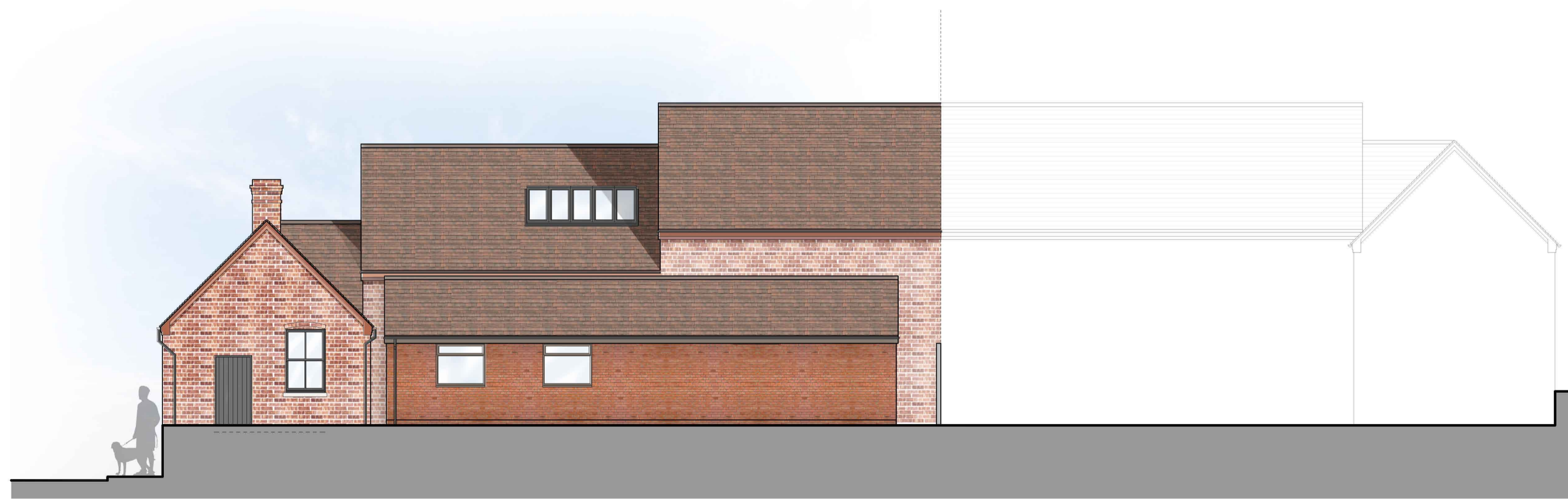
REAR ELEVATION AS PROPOSED Scale 1:100

Existing Render to be painted 'Little Greene Portland Stone Light' Intelligent Exterior Eggshell Or Similar to LA approval. Dark Brown UPVC Cladding Modern Red Brick Brown UPVC Top hung casement windows Brick in-fill Panel Original Brick Work Blue Brick Cill Timber Sash Windows UPVC Black / Grey Frames Blue Brick Stone Wall (adjacent to highway)