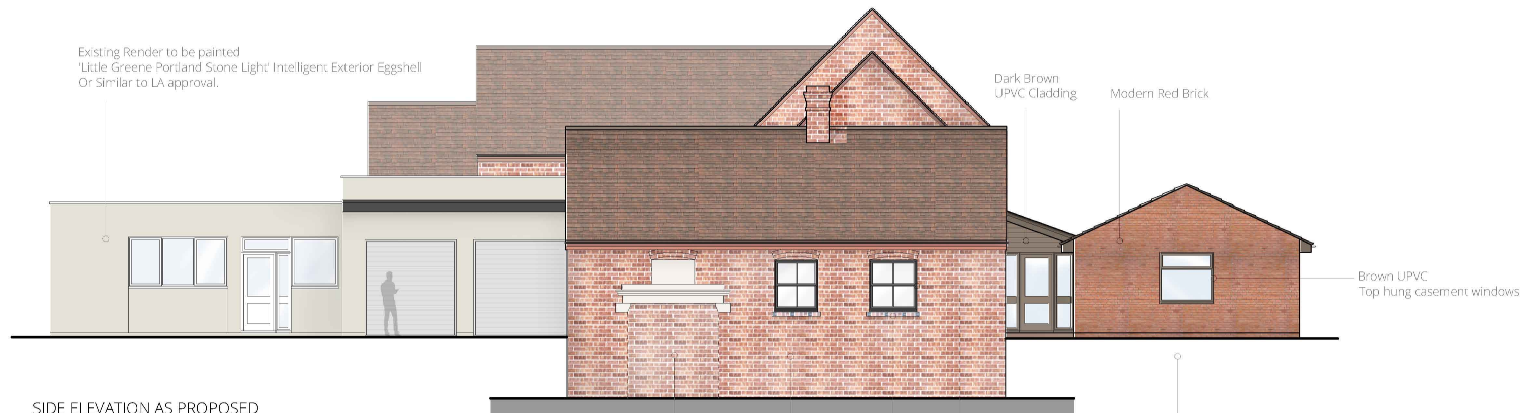
SIDE ELEVATION AS PROPOSED Scale 1:100

Existing Render at upper level to be painted 'Little Greene Baluster' Intelligent Exterior Eggshell or similar. Clay Plain Tiles to be replaced / repaired as necessary Clay Plain Tiles Black Fascia With Black UPVC Guttering and Rain Water Pipes Black RWP Full height windows with Black / grey frames Render infill Reclaimed Brick Lighter shade, mixed with white and darker browns Existing render to be painted in 'Little Greene Pompeian Ash' Intelligent Exterior Eggshell or similar Signage to be replaced