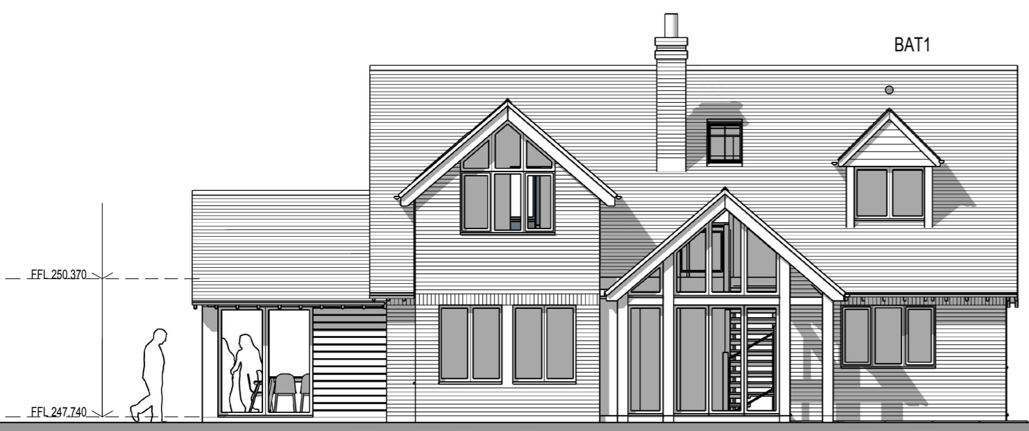
FRONT (South) ELEVATION - Proposed

See Cadplan Topographical Survey for levels datum 0 0.5 1 2 4m