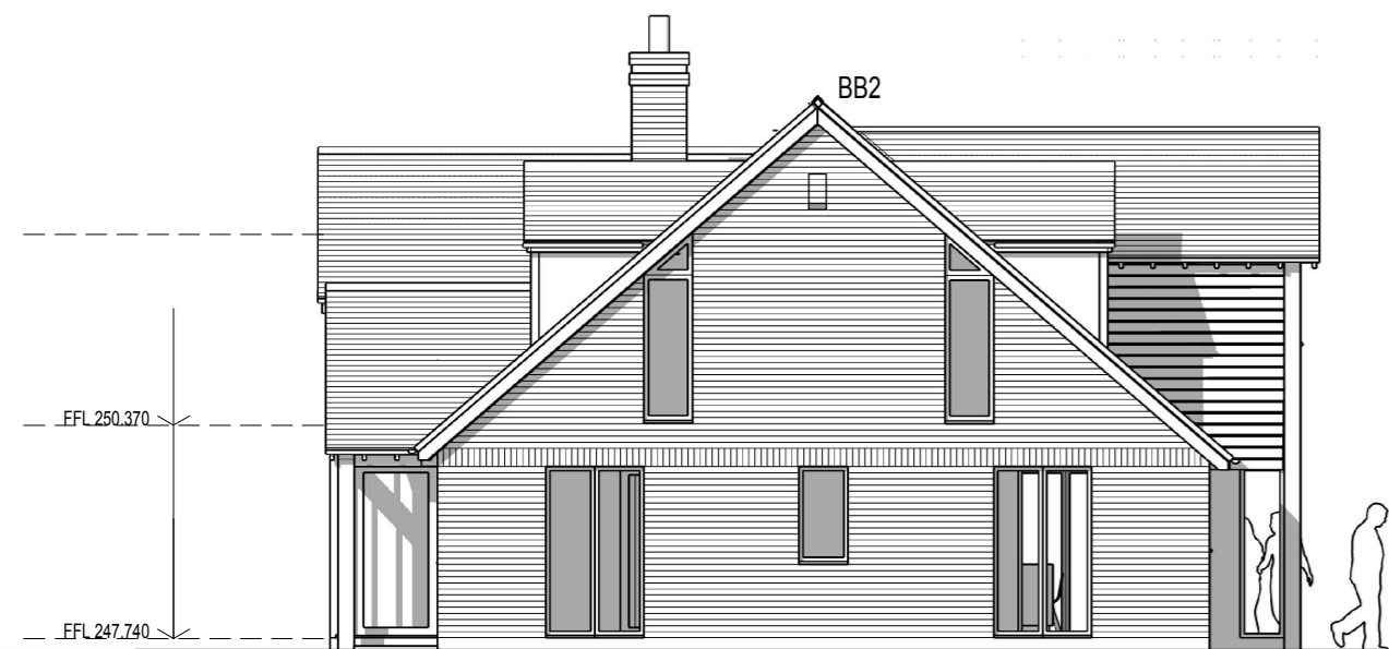
EAST ELEVATION - Proposed

See Cadplan Topographical Survey for levels datum