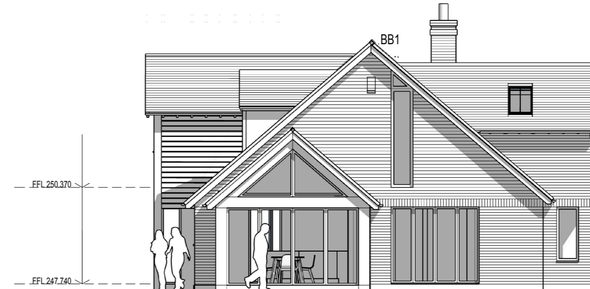
WEST ELEVATION - Proposed

See Cadplan Topographical Survey for levels datum