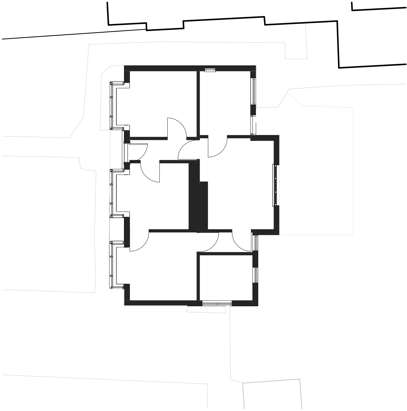
Existing Ground Floor 1 : 100