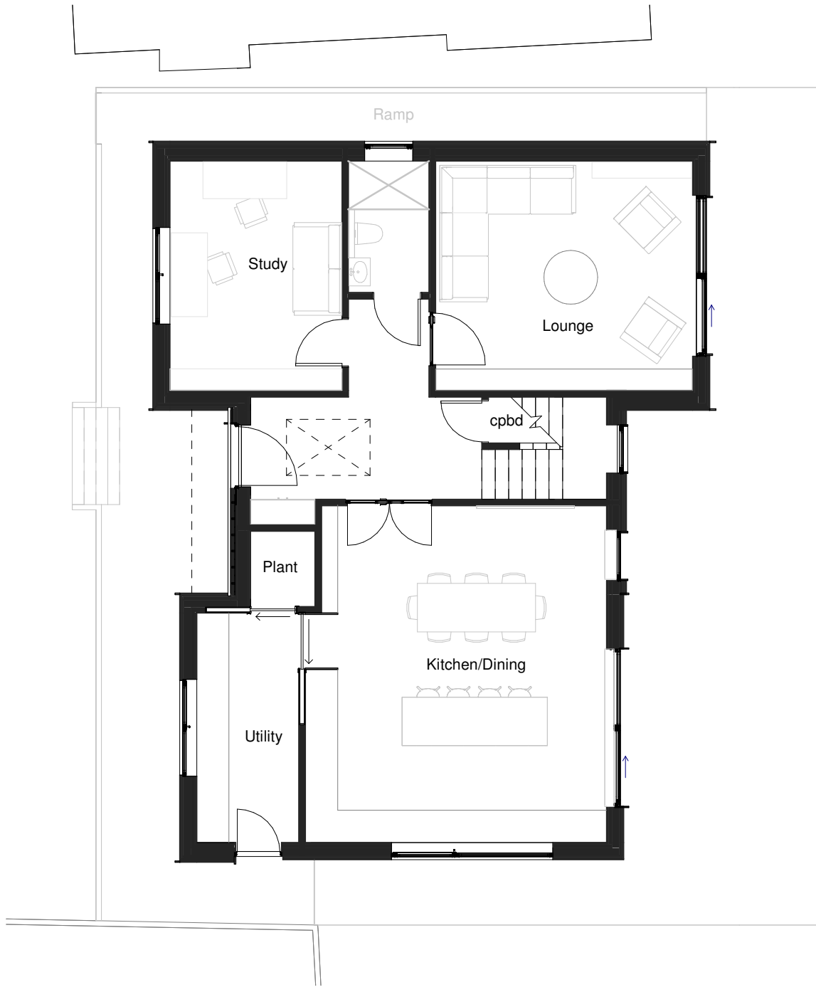
Proposed Ground Floor 1 : 100