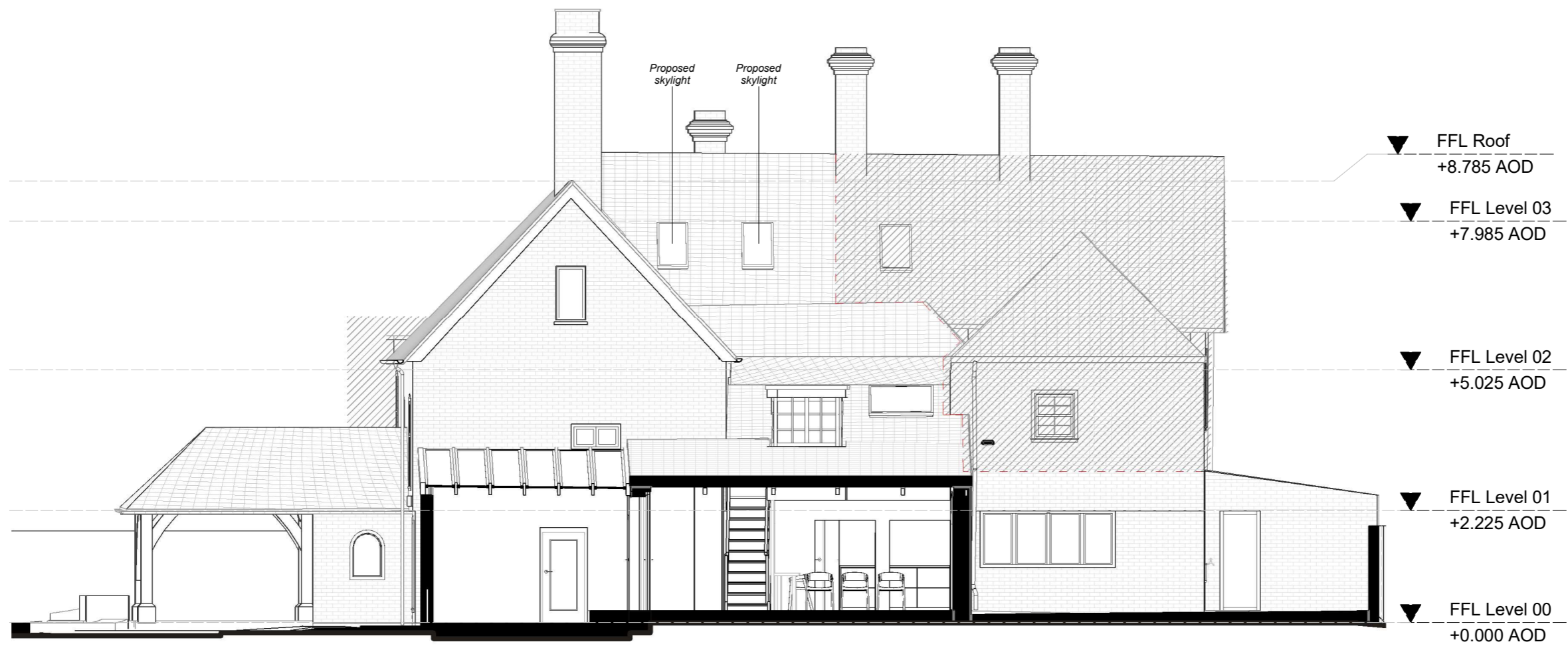
1 Section G 33040 1 : 100