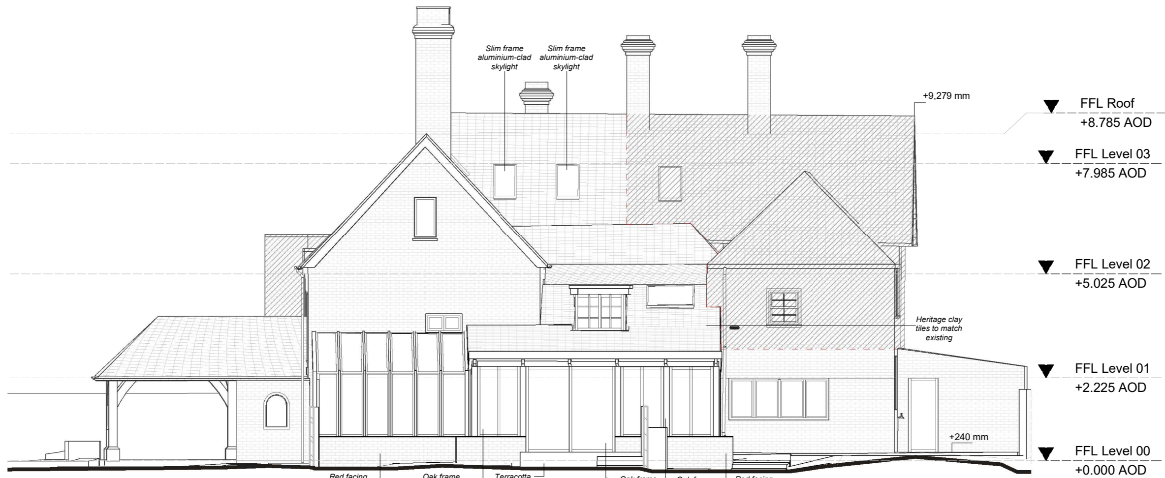
1 South Elevation 32020 1 : 100