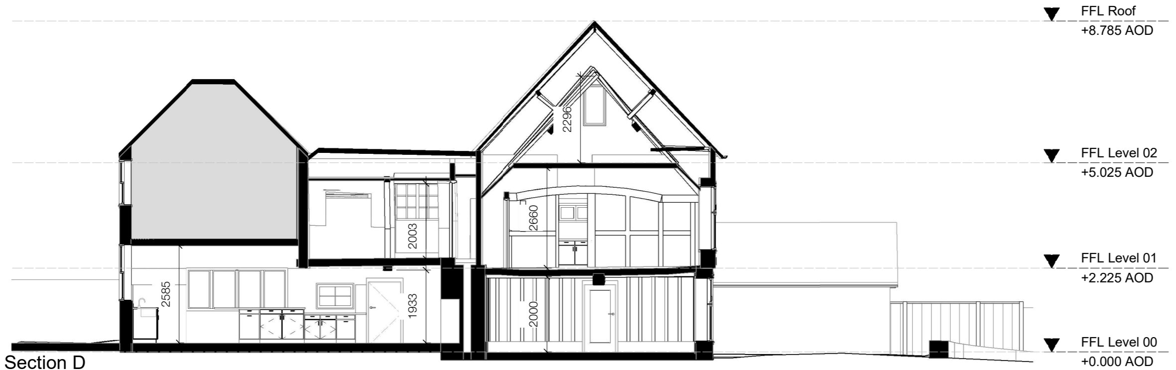
2 Section D 11060B 1 : 100