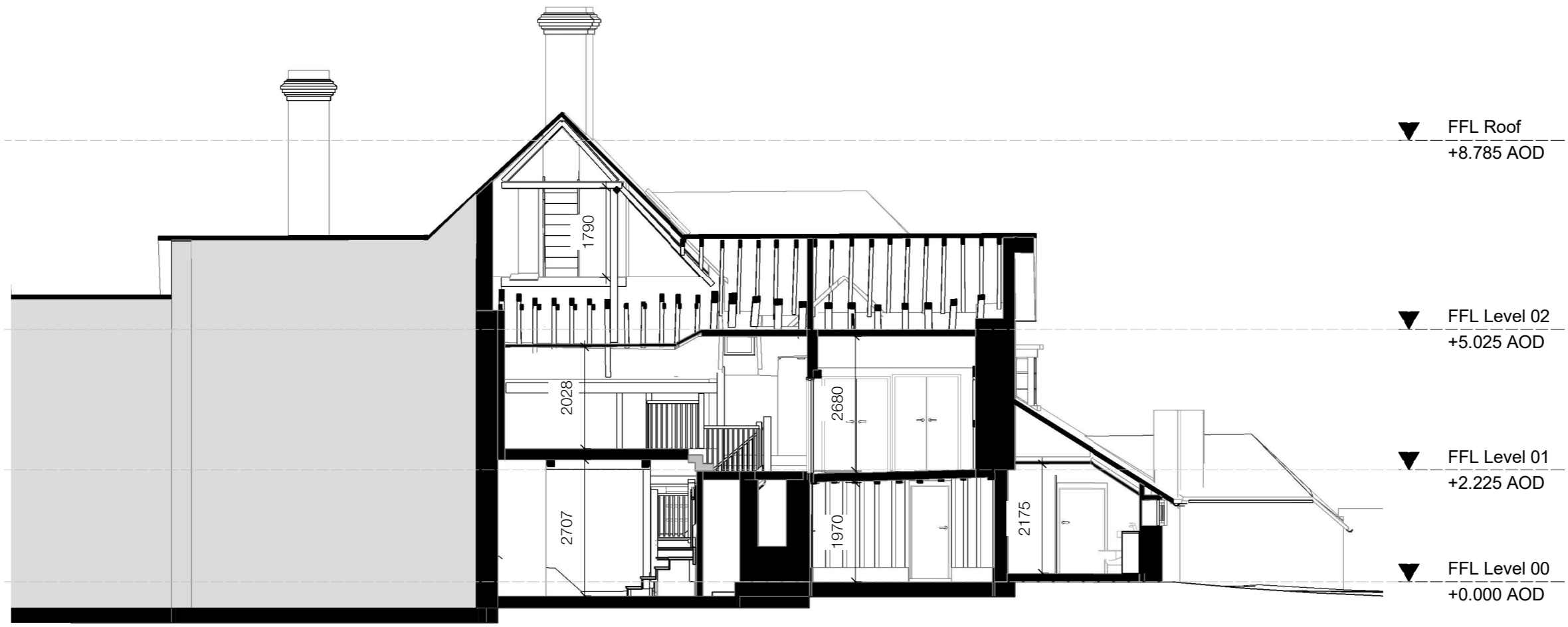
1 Section C 11060B 1 : 100