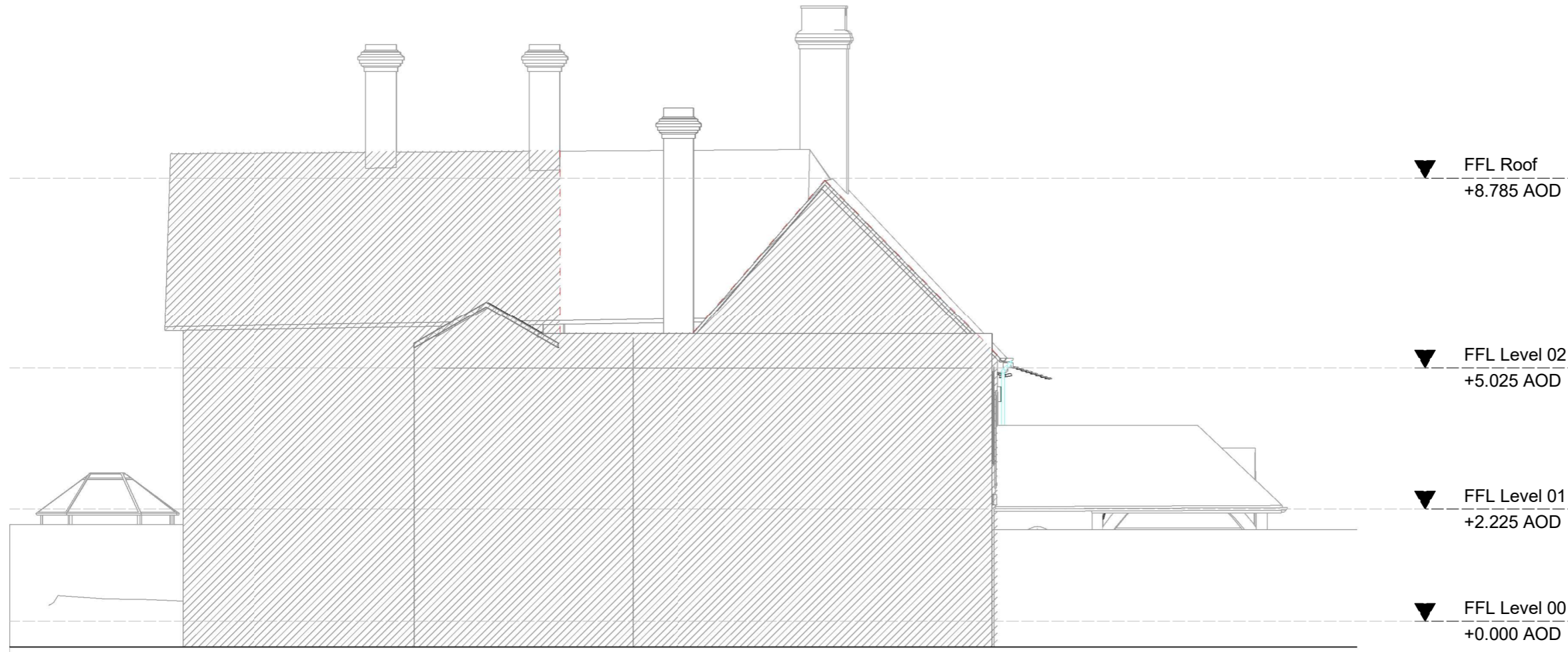
1 North Elevation Existing 11050A 1 : 100