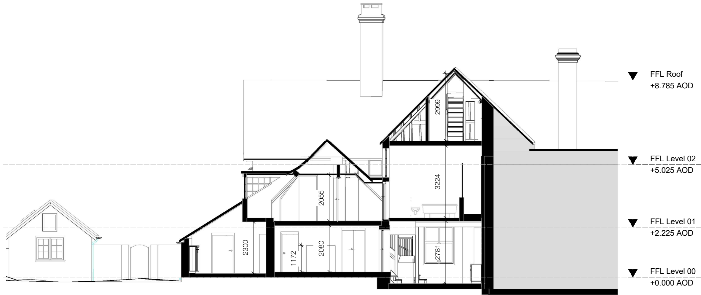
1 Section E 11060C 1 : 100