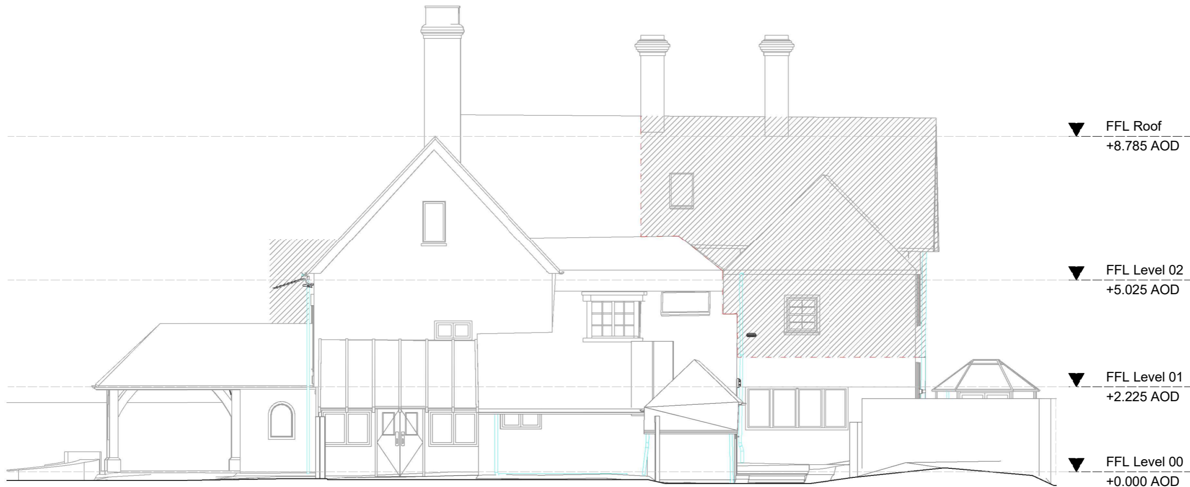
1 South Elevation Existing 11050B 1 : 100