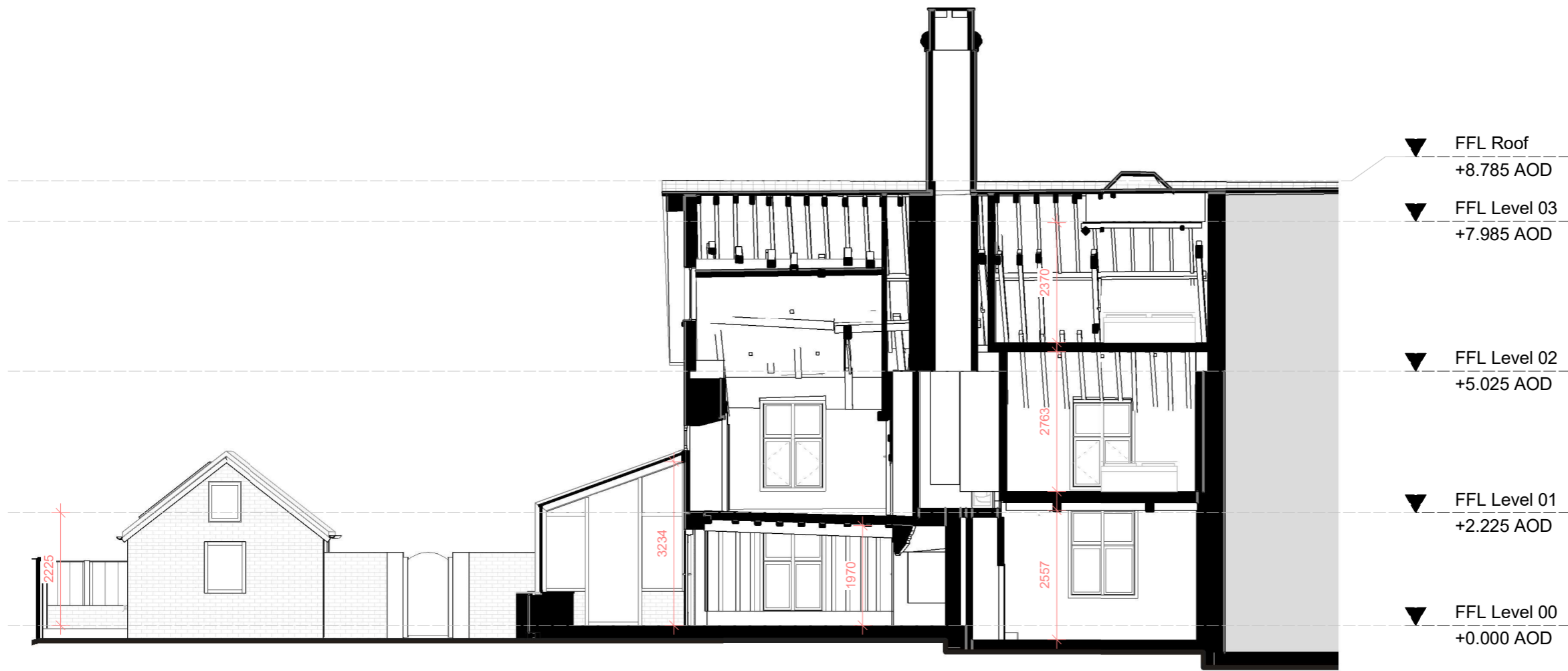
1 Section A 33010 1 : 100