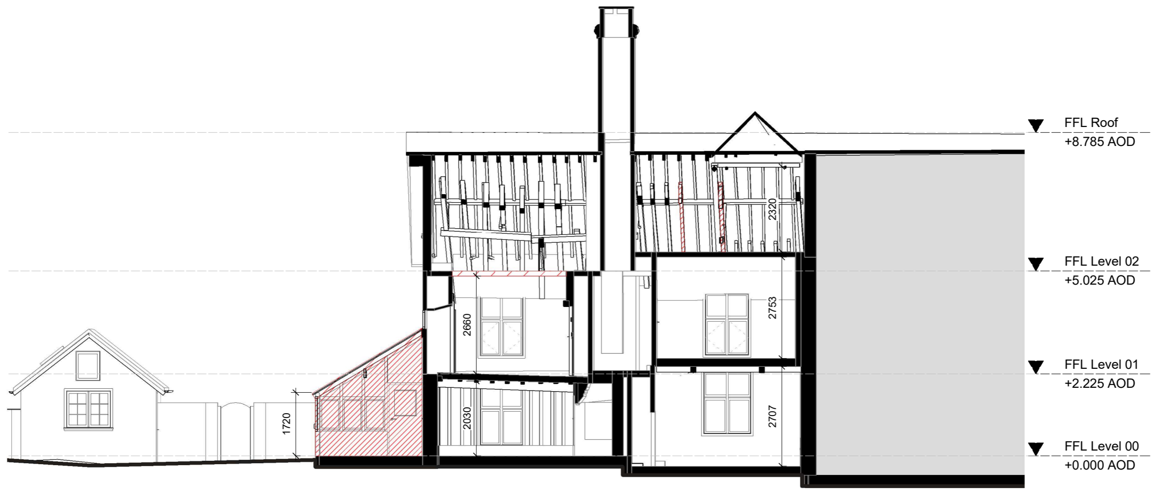
1 Section A 21060A 1 : 100