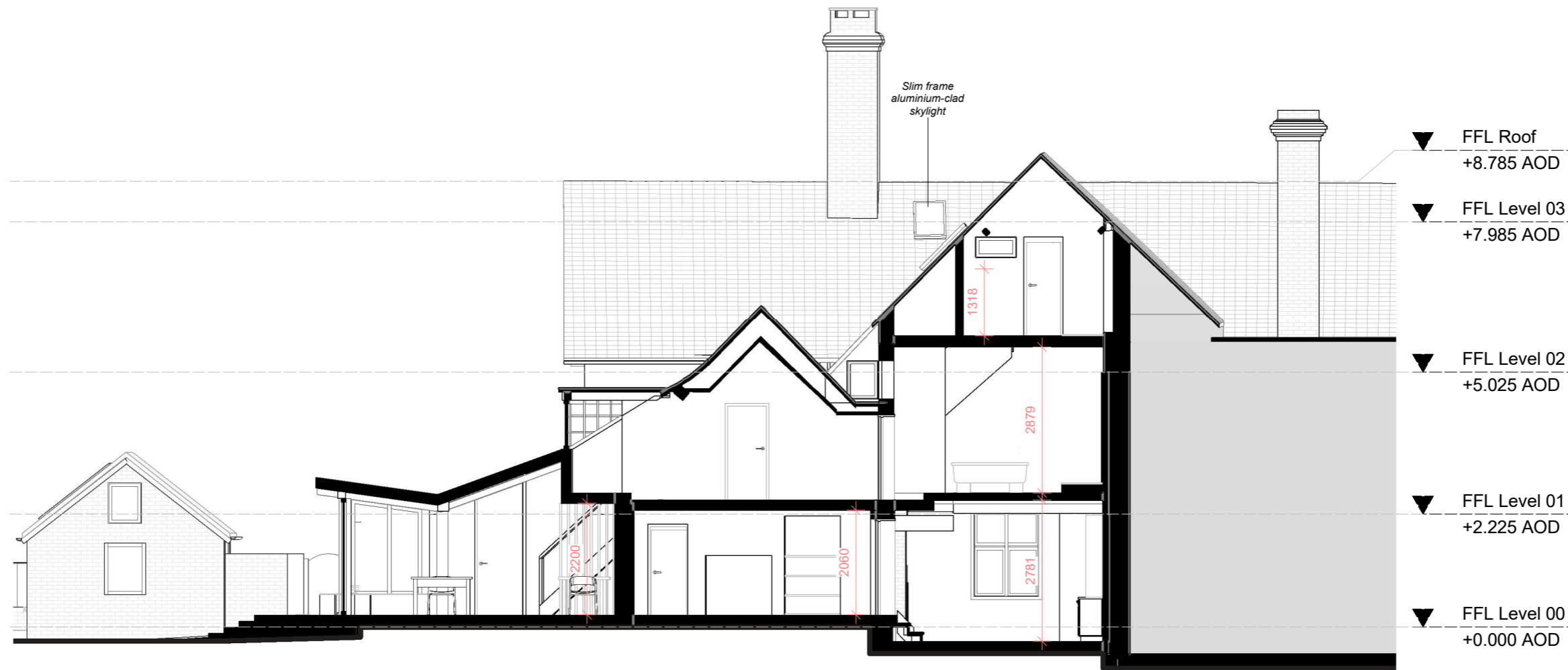
1 Section E 33030 1 : 100