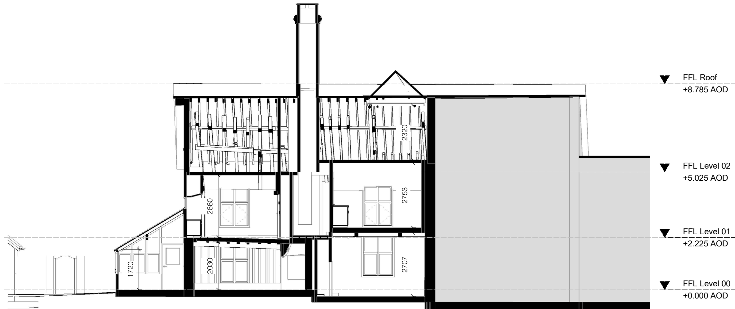
1 Section A 11060A 1 : 100