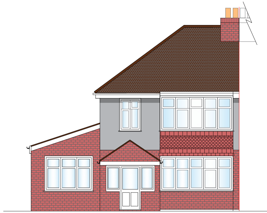
Proposed: Front Elevation