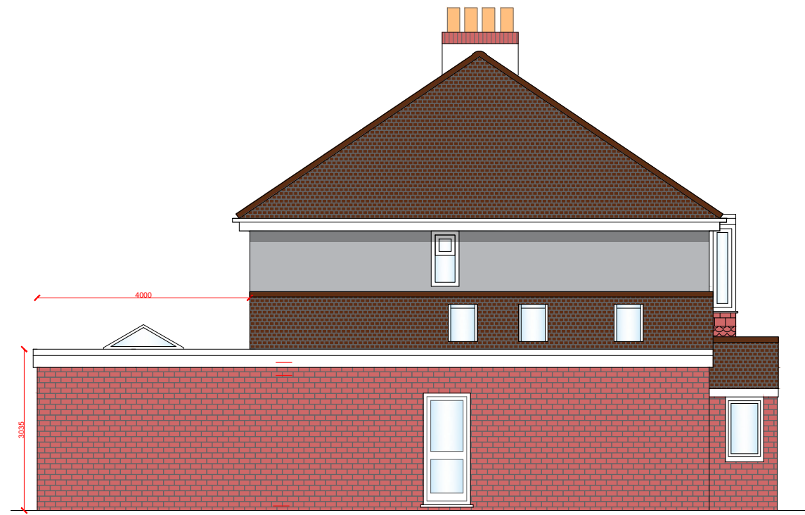
Proposed: Side Elevation