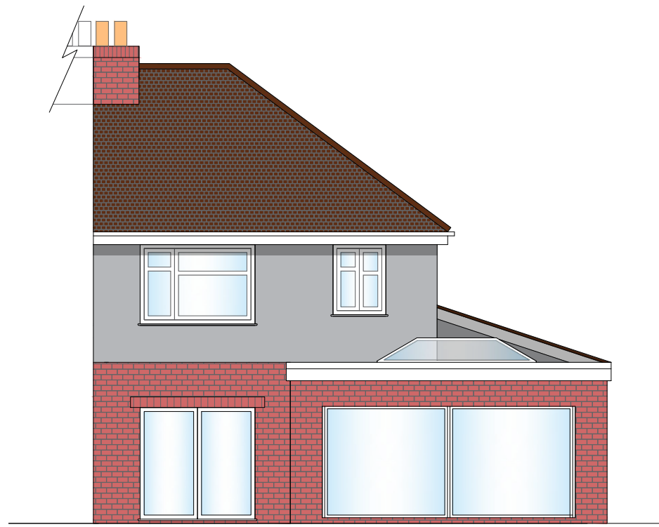
Proposed: Rear Elevation