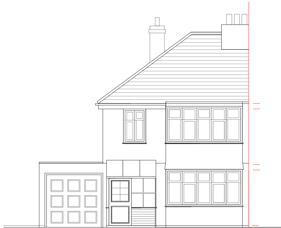
EXISTING: Front Elevation