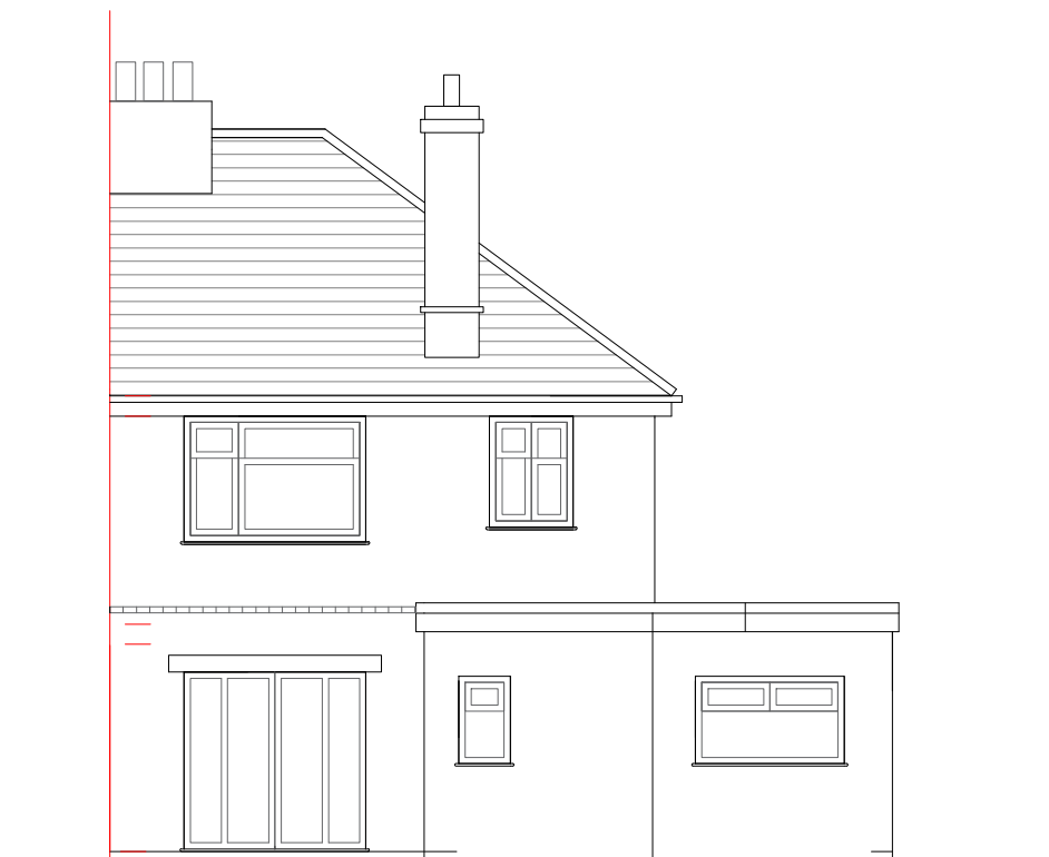
EXISTING: Rear Elevation