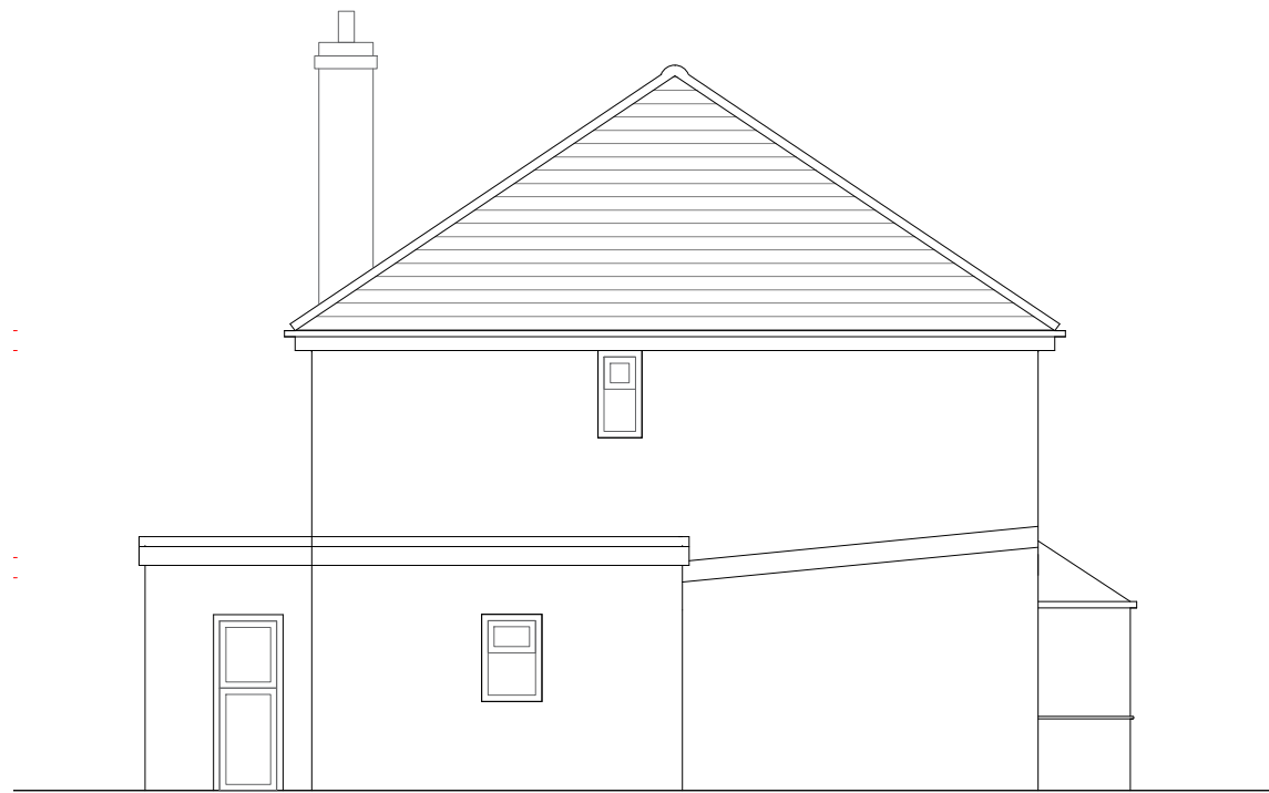
EXISTING: Side Elevation