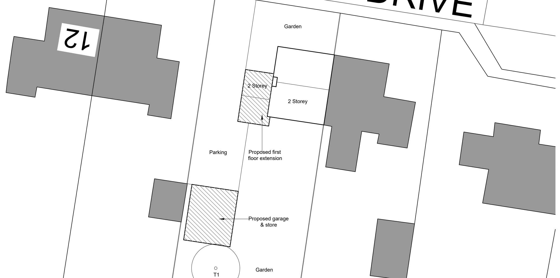
1:200 Existing Block Plan