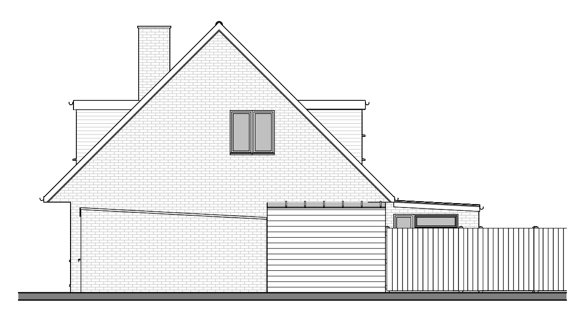
Side 2 Elevation