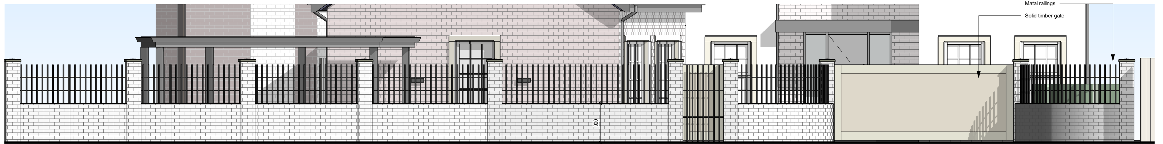
1 Front Boundary - Existing Elevation 1 : 50