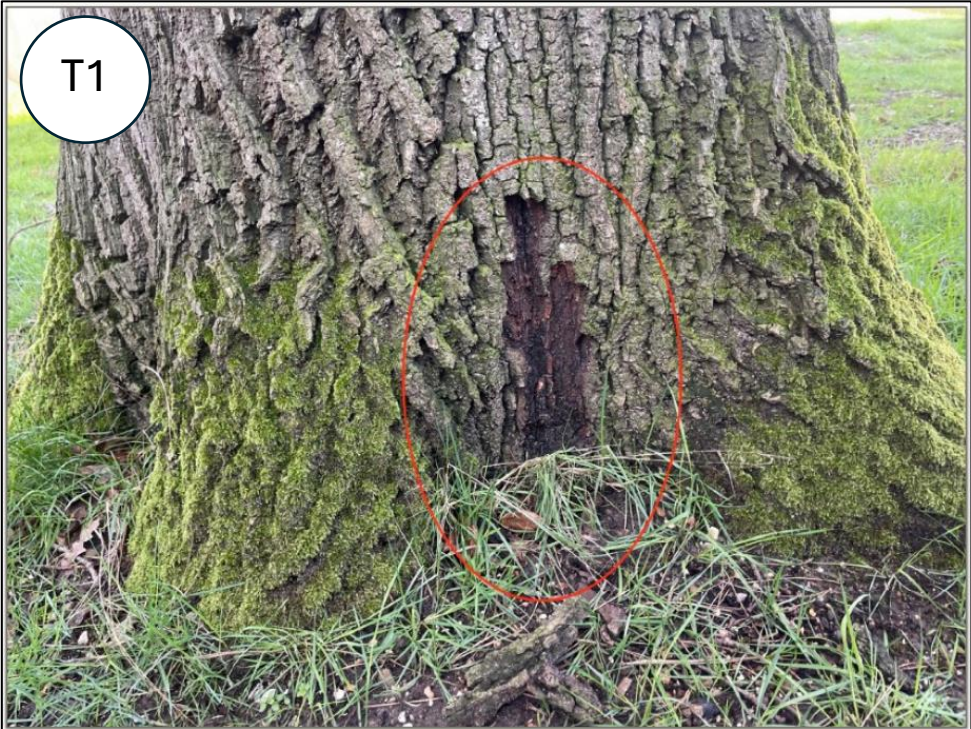
Figure 3. Cambial dieback and softening of bark and timber on the eastern aspect.