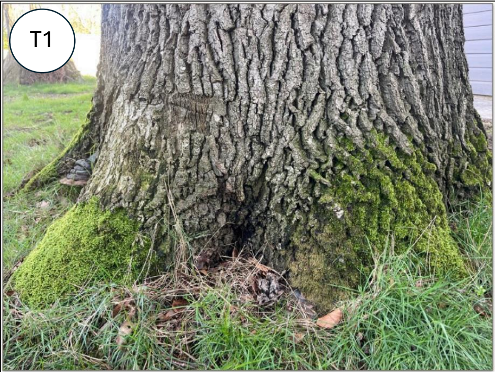
Figure 4. Darkening of the bark between buttressing.