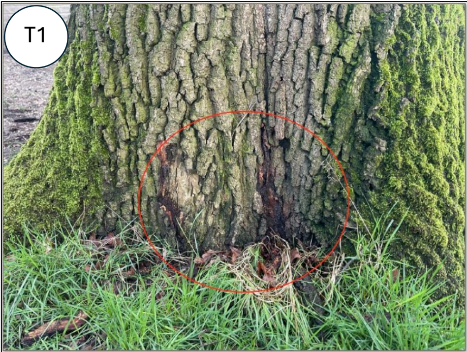
Figure 2. Cambial dieback and softening of bark and timber on the northern aspect.