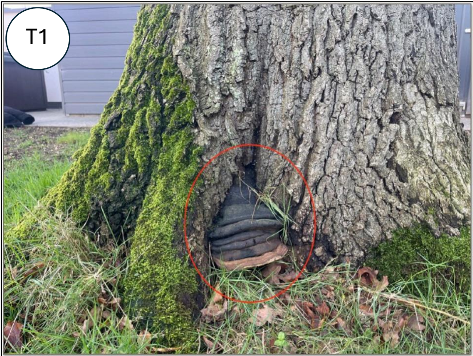
Figure 1. Fruiting fungal body of Ganoderma australe .