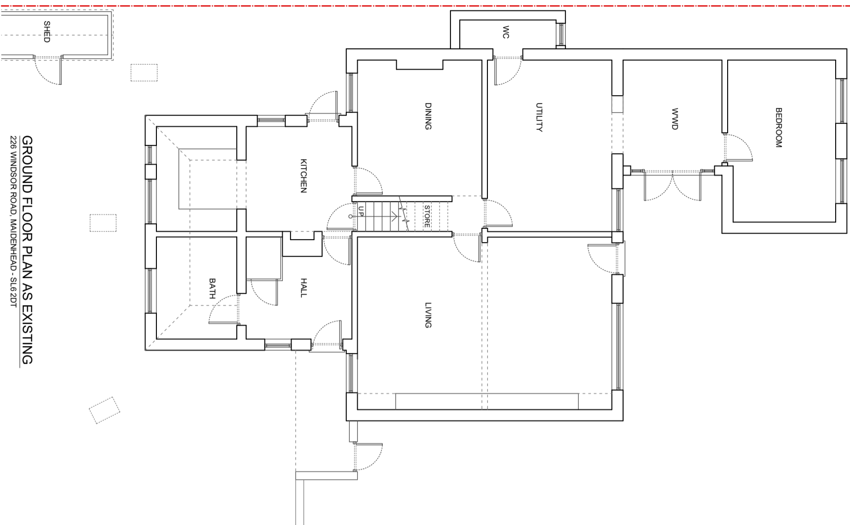
GROUND FLOOR PLAN AS EXISTING 226 WINDSOR ROAD, MAIDENHEAD - SL6 2DT