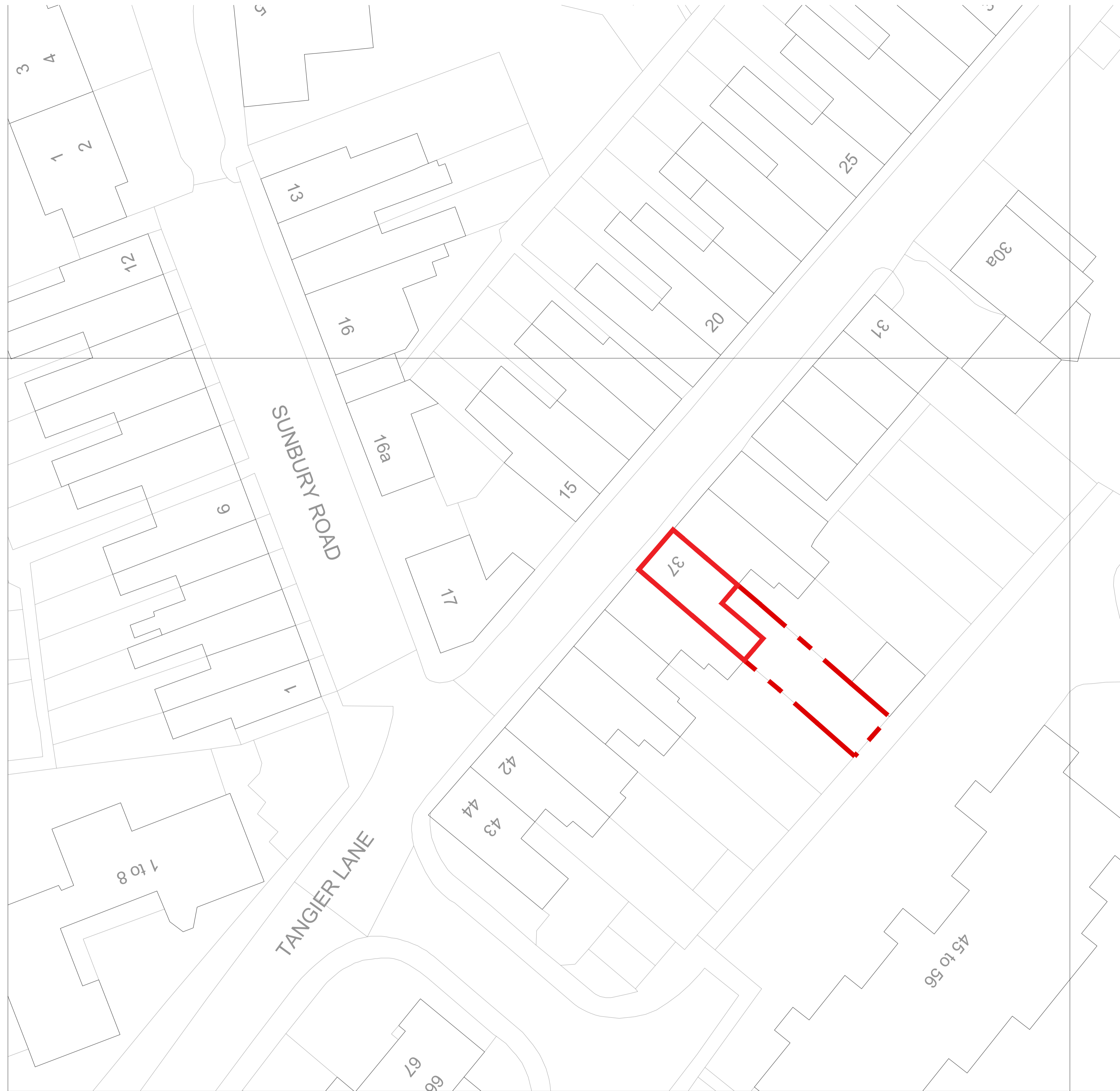
1 EXISTING SITE PLAN scale: 1:200 @A1