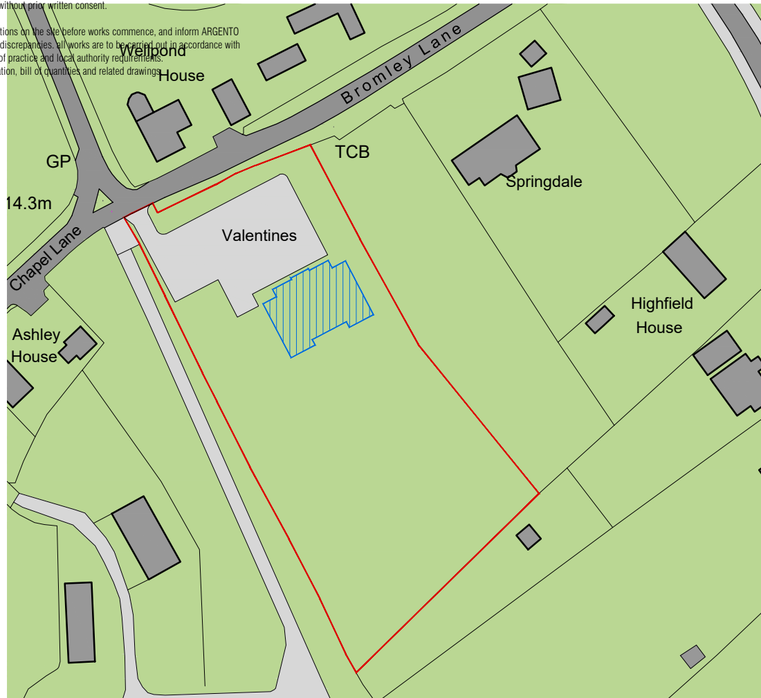
[01] LOCATION PLAN 1:1250

the contractors are to check all dimensions, drain runs and general conditions on the site before works commence, and inform ARGENTO DESIGN STUDIO immediately upon discovery of any errors, omissions or discrepancies. All works are to be completed in accordance with current building regulations, british standards, code of practice and local authority requirements. this drawing must be read together with the specification, bill of quantities and related drawings.