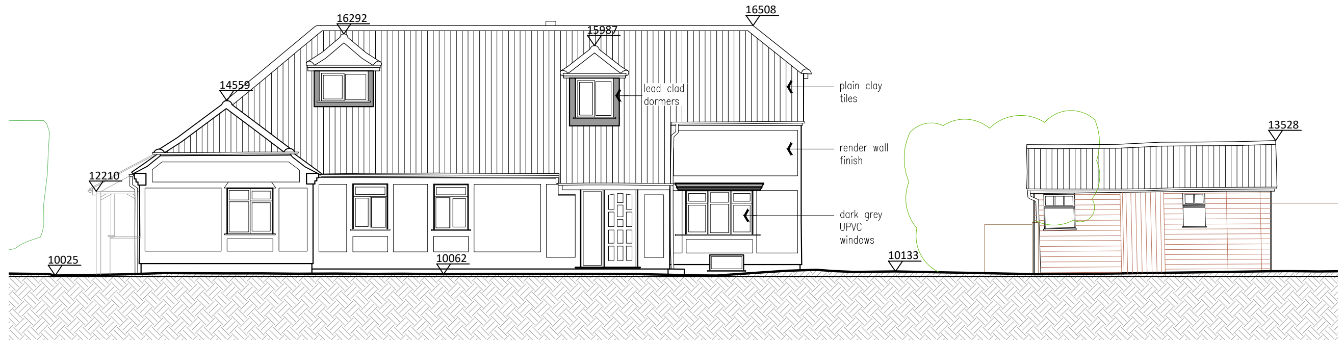
[01] EXISTING FRONT ELEVATION (NORTH)