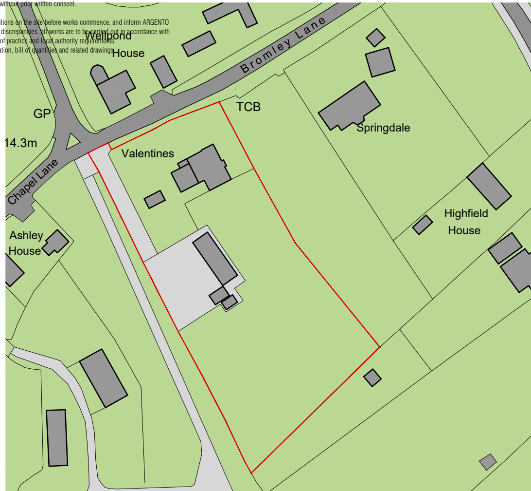
[01] LOCATION PLAN 1:1250

the contractors are to check all dimensions, drain runs and general conditions on the site before works commence, and inform ARGENTO DESIGN STUDIO immediately upon discovery of any errors, omissions or discrepancies. All works are to be completed in accordance with current building regulations, british standards, code of practice and local authority requirements. this drawing must be read together with the specification, bill of quantities and related drawings.